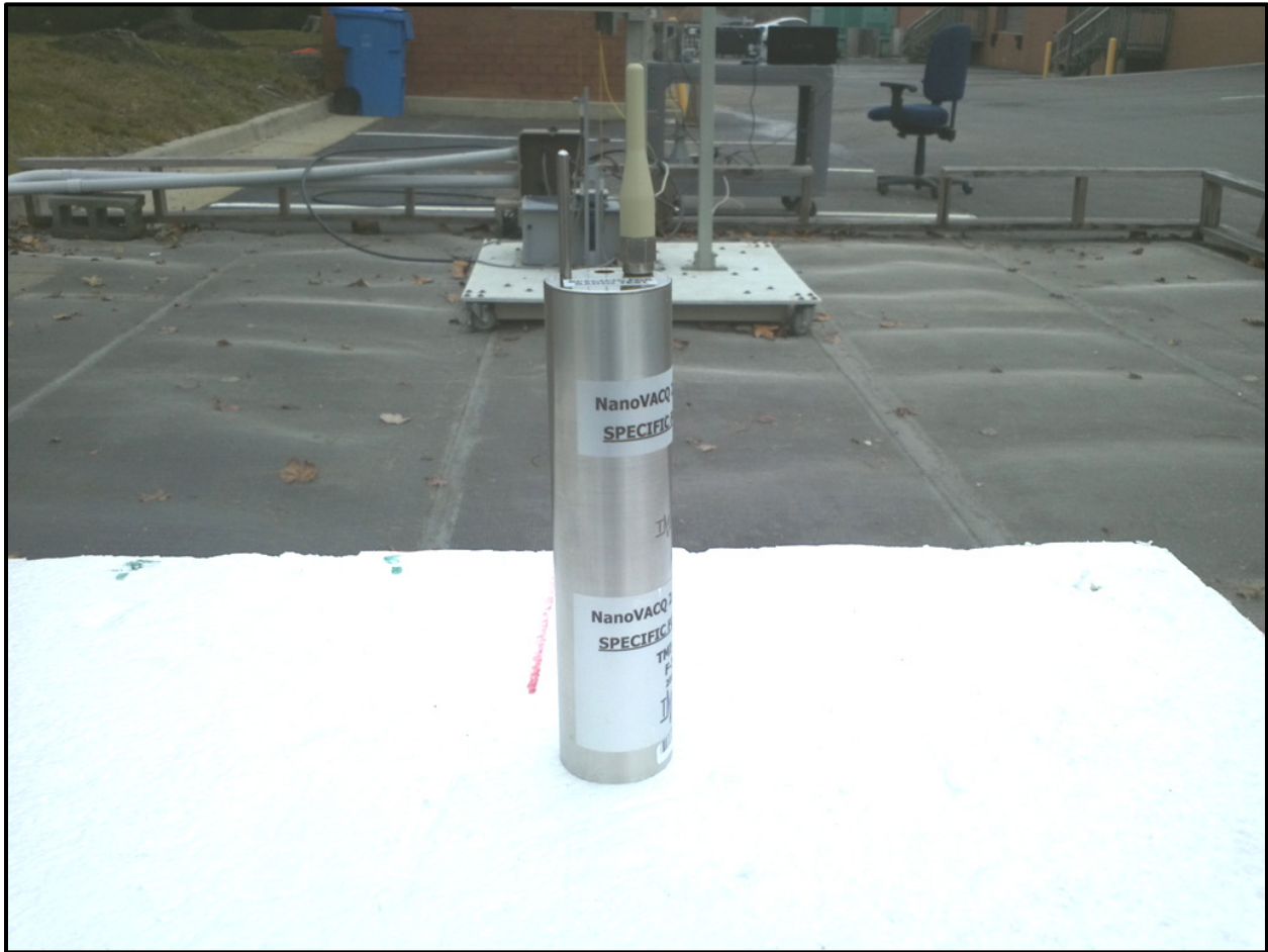
Photograph 2: Radiated Testing –Typical Host