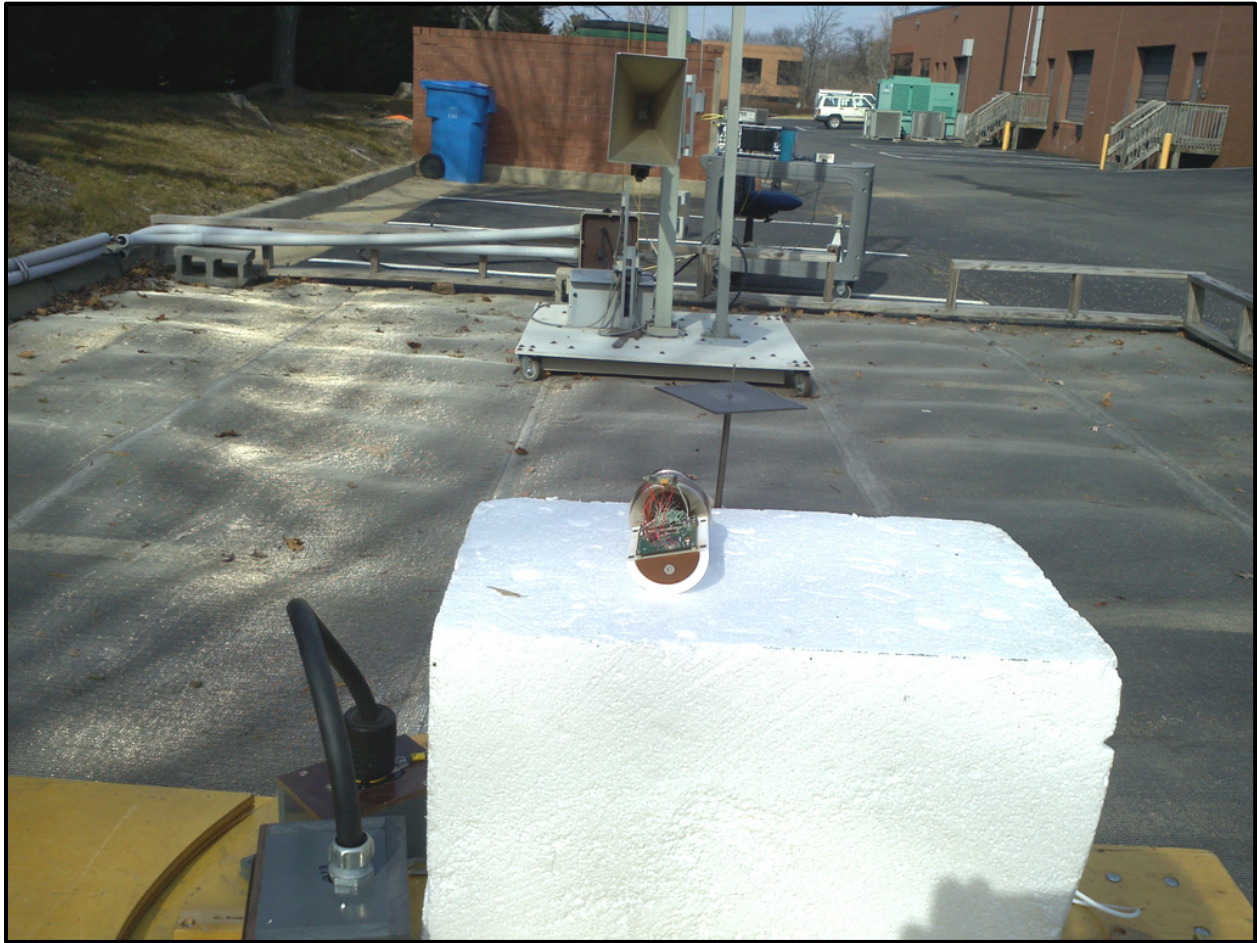
Photograph 3: Radiated Testing – Stand-alone Configuration