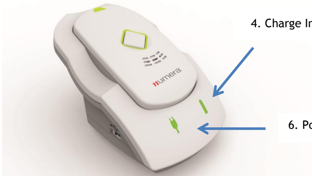
6. Power Indicator