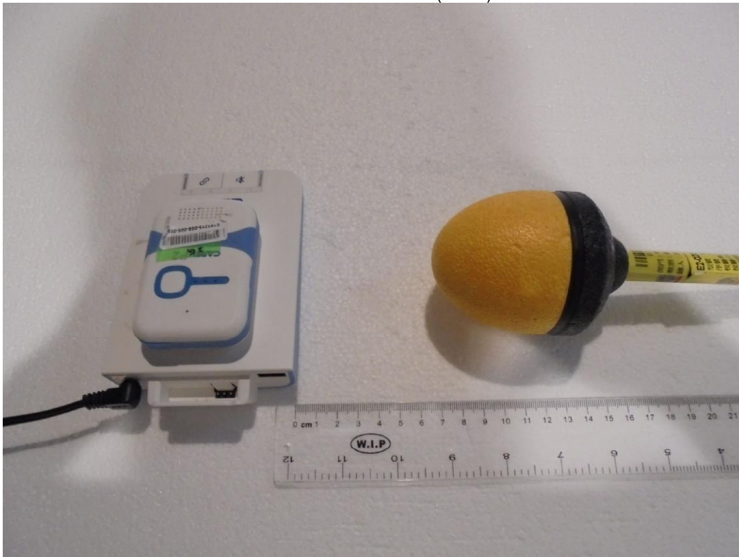
E-Field Measurement (10cm)