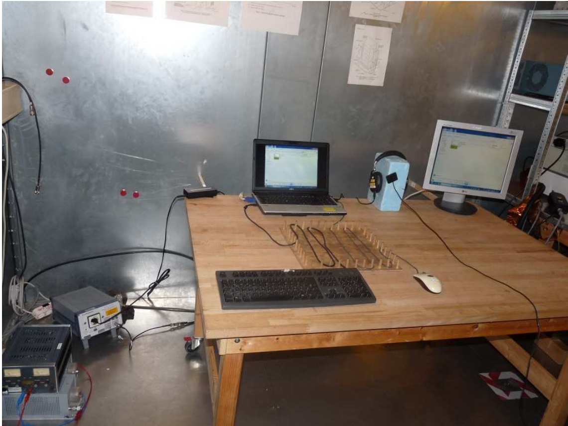
Photo 5: Test setup for conducted measurements (below 30 MHz, AC mains)