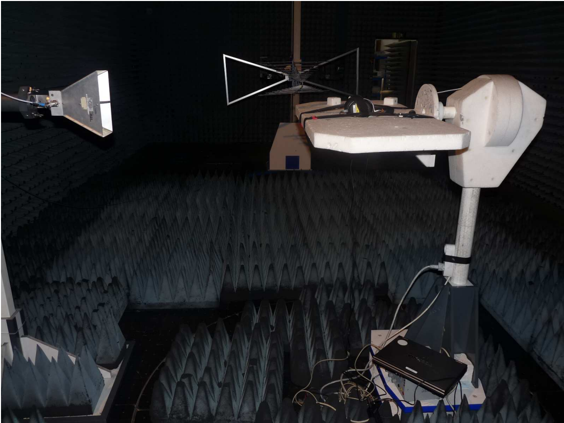
Photo 3: Test setup for radiated measurements (above 1 GHz up to 18 GHz)