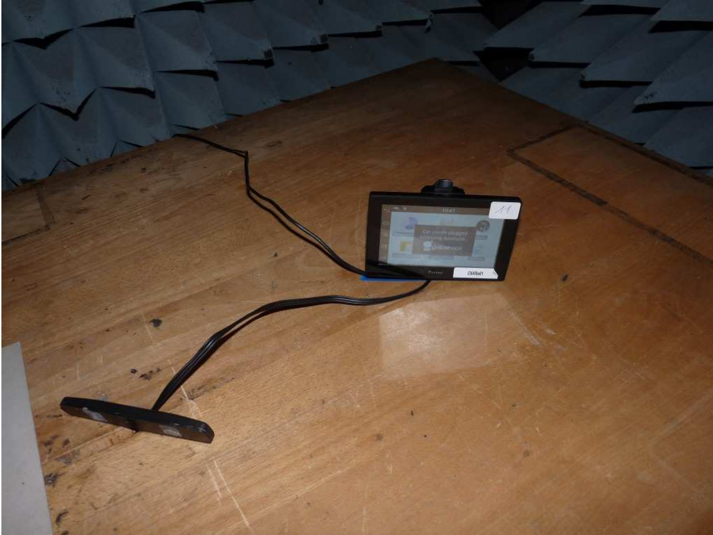
Photo 1: Test setup for radiated measurements (below 30 MHz), FCC 15.247