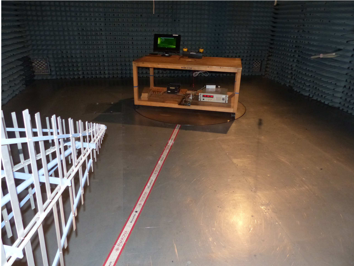
Photo 6: Test setup for radiated measurements (computer peripheral setup, HDMI data transfer to the display enabled, unintentional radiator §15)