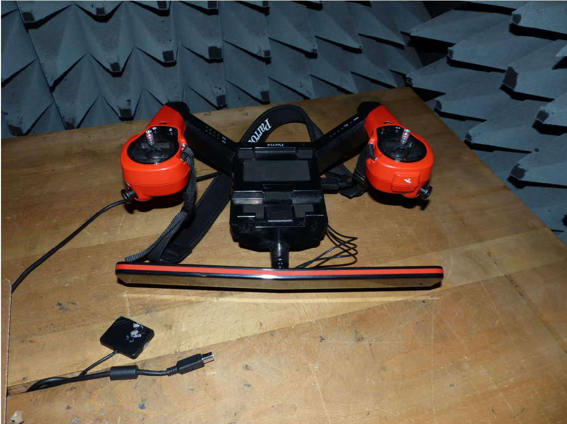
Photo 1: Test setup for radiated measurements (Enclosure, below 30 MHz, intentional radiator §15)