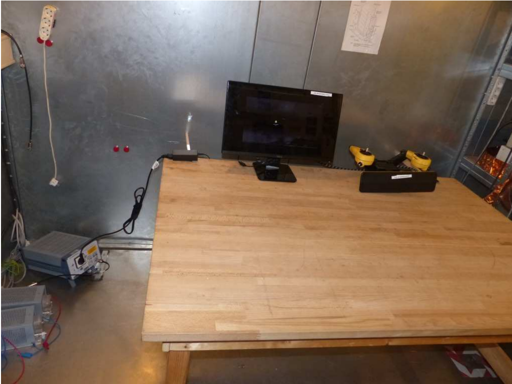
Photo 5: Test setup for conducted measurements (computer peripheral setup, HDMI data transfer to the display enabled, charging mode, unintentional radiator §15)