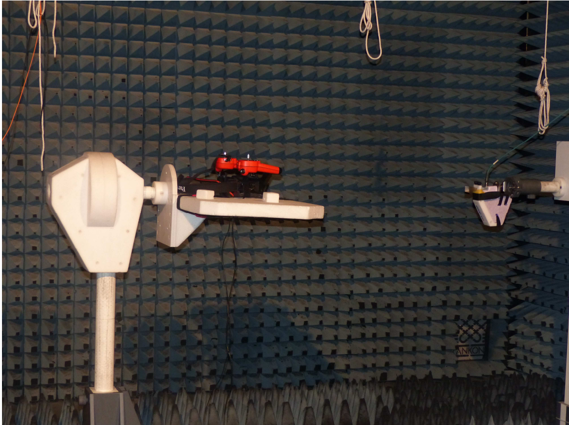
Photo 4: Test setup for radiated measurements (Enclosure, fully-anechoic chamber, 18-25 GHz, intentional radiator § 15.247)