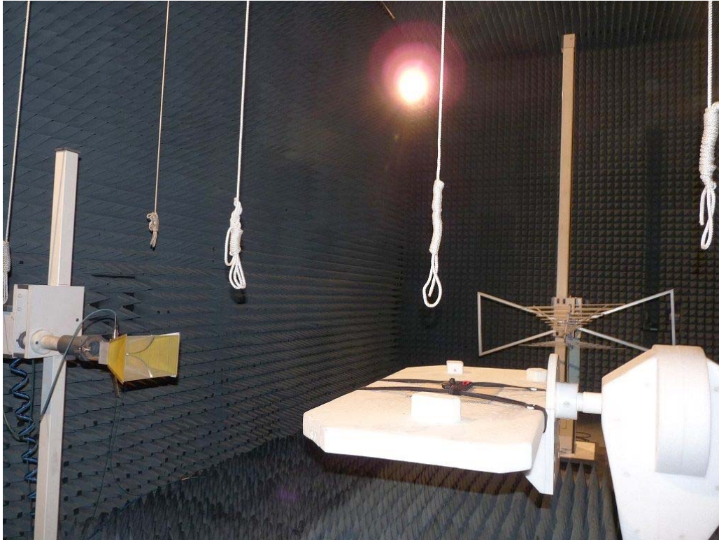
Photo 3: Test setup for radiated measurements (Enclosure, fully-anechoic chamber, 1-18 GHz intentional radiator §15)