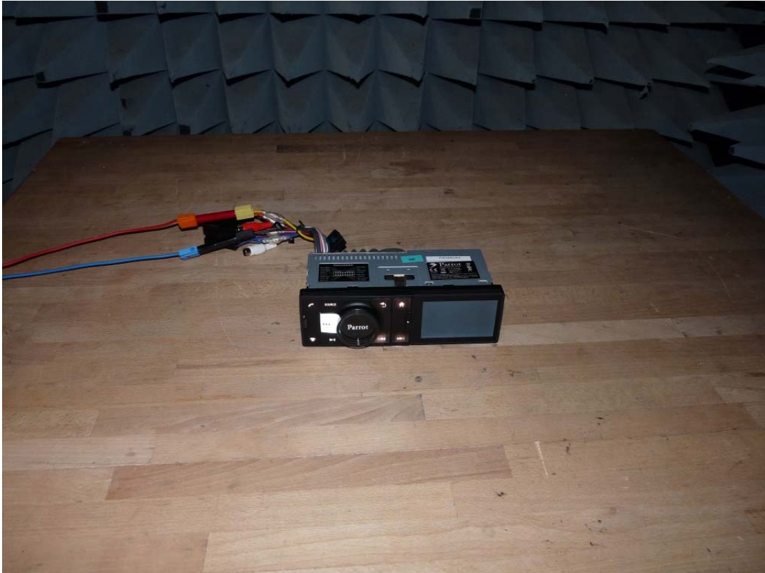
Photo 1: Test setup for radiated measurements (Enclosure, below 30 MHz)