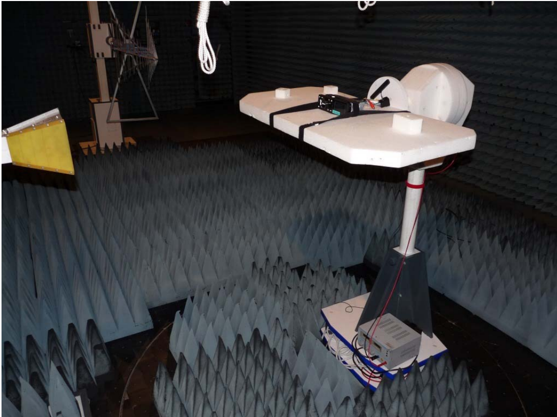
Photo 3: Test setup for radiated measurements (Enclosure, above 1 GHz)