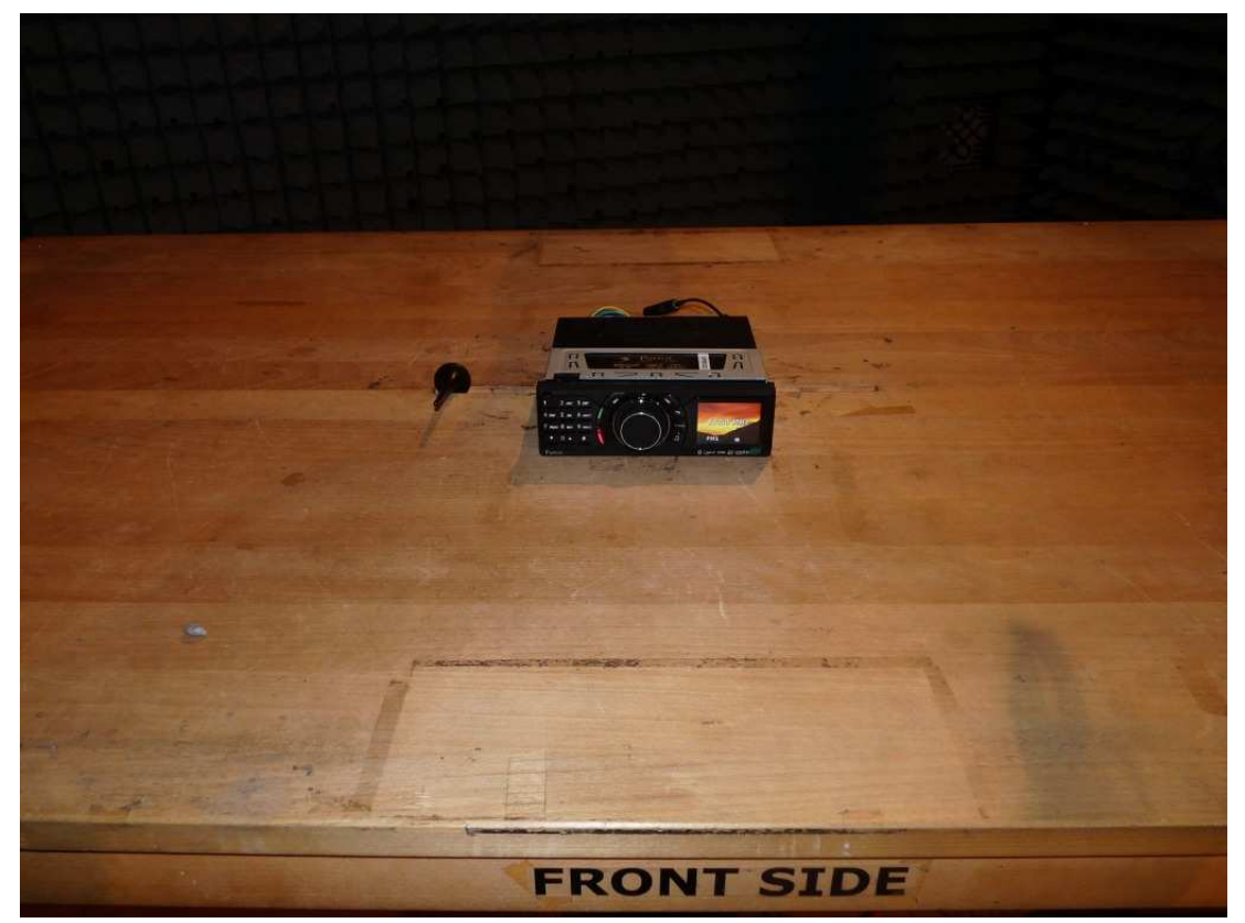
Photo 2: Test setup for radiated measurements (Enclosure, 30 MHz to 1 GHz)