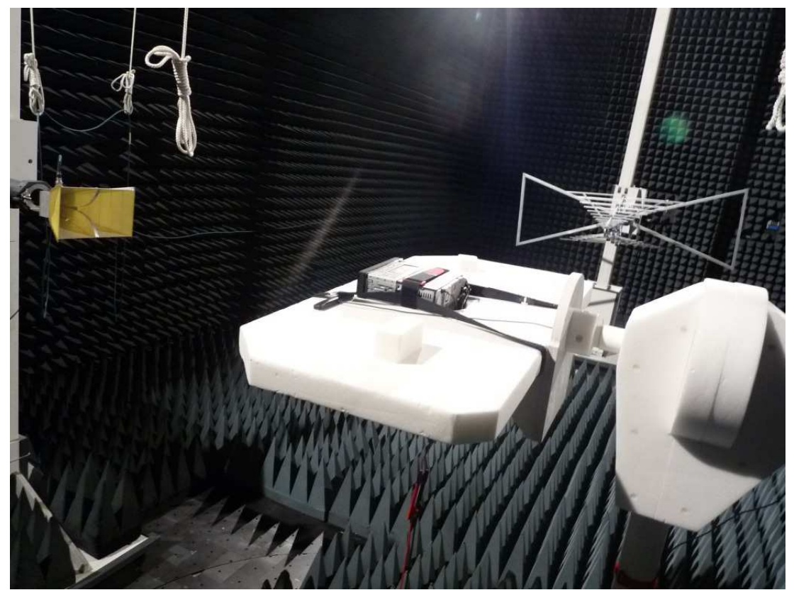
Photo 3: Test setup for radiated measurements (Enclosure, above 1 GHz)