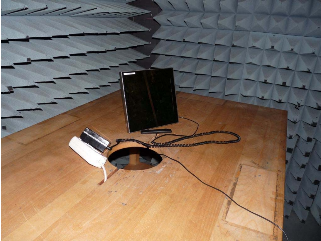
Photo 1: Test setup for radiated measurements (Enclosure, below 30 MHz)