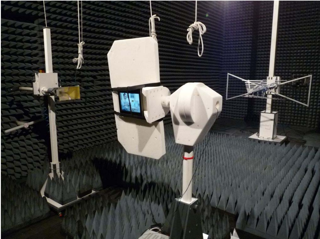
Photo 3: Test setup for radiated measurements (Enclosure, above 1 GHz)