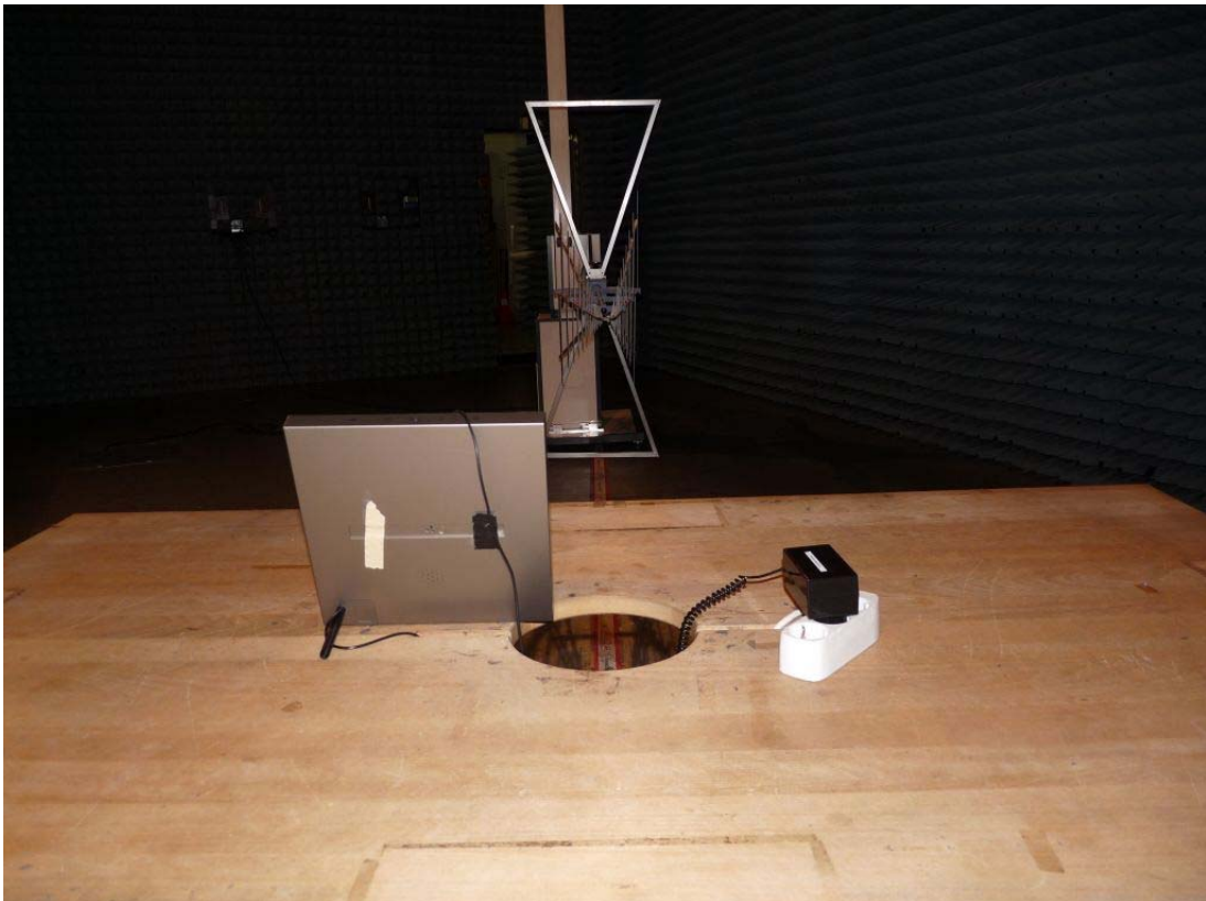
Photo 2: Test setup for radiated measurements (Enclosure, 30 MHz to 1 GHz)