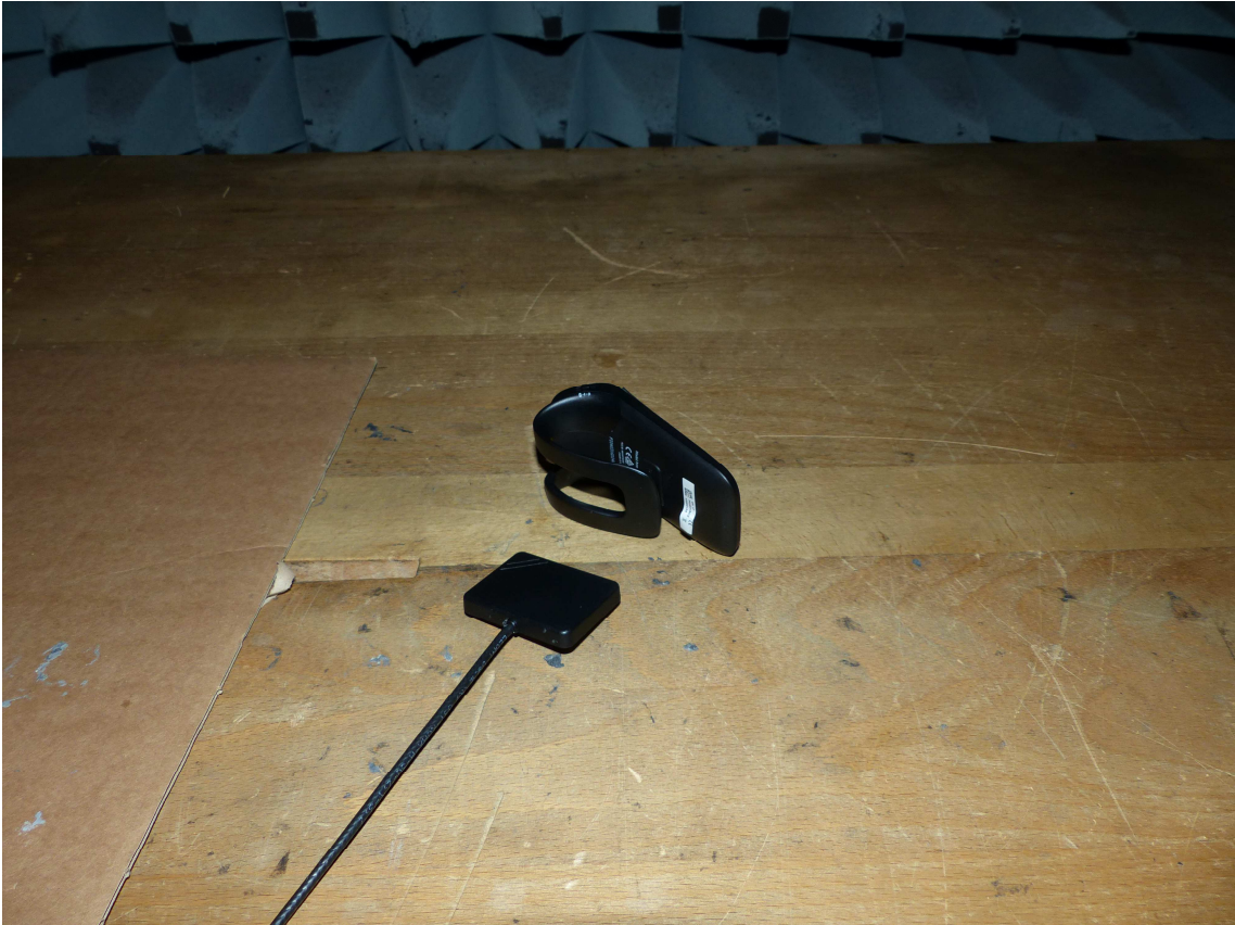
Photo 1: Test setup for radiated measurements (Enclosure, below 30 MHz, intentional radiator §15)