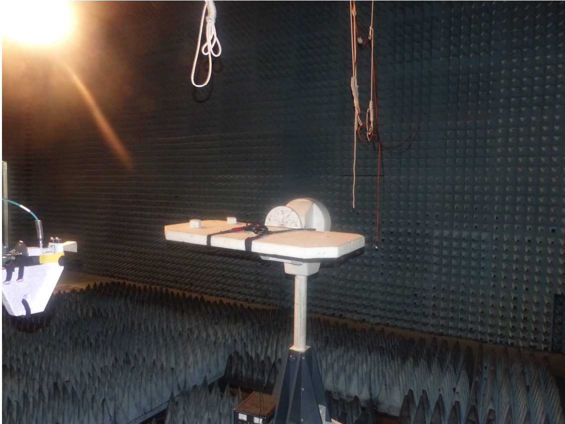
Photo 4: Test setup for radiated measurements (Enclosure, fully-anechoic chamber, 18-25 GHz, intentional radiator § 15.247)