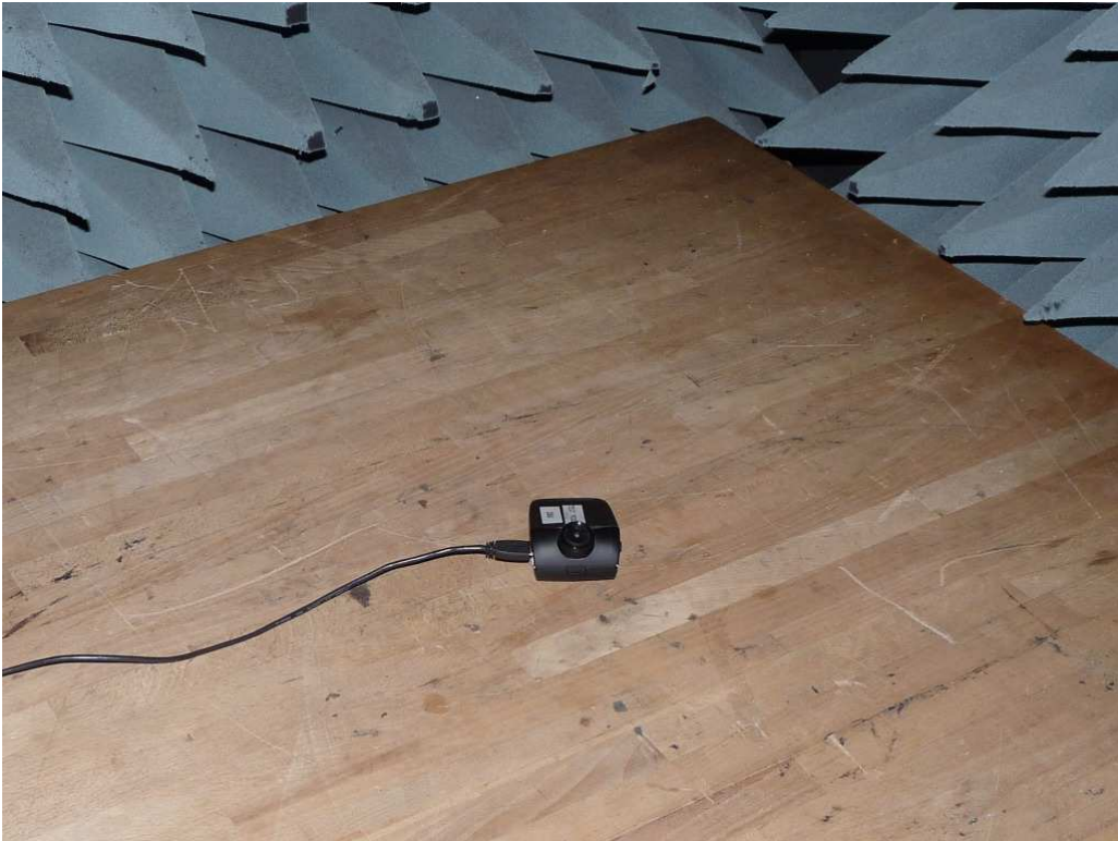
Photo 1: Test setup for radiated measurements (below 30 MHz), FCC 15.247