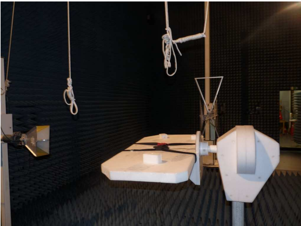
Photo 3: Test setup for radiated measurements (above 1 GHz), FCC 15.247