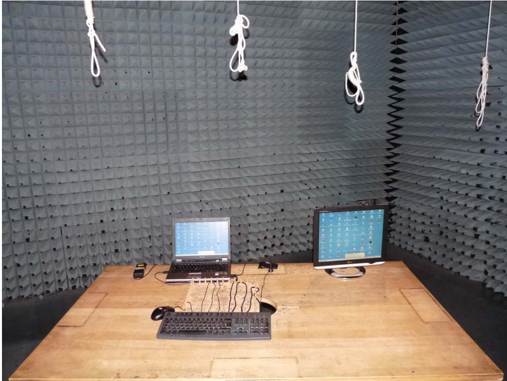
Photo 3: Test setup for radiated measurements (Enclosure, 30 MHz to 1 GHz)