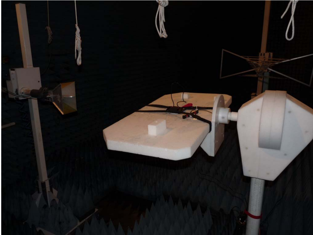
Photo 4: Test setup for radiated measurements (Enclosure, above 1 GHz)