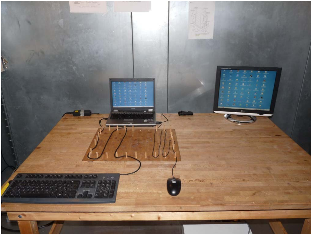
Photo 5: Test setup for conducted measurements (AC Port (power line))