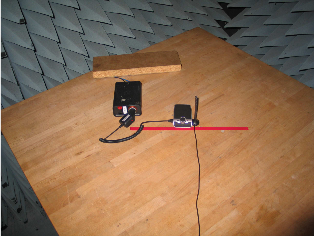
Photo 2: Test setup (Setup_a02) for radiated measurements (Enclosure, below 30 MHz)