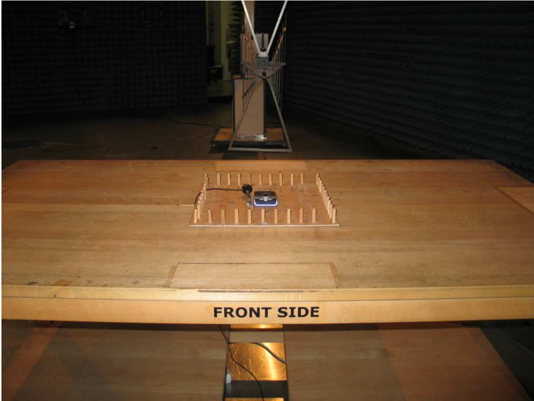
Photo 1: Test setup for radiated measurements (Enclosure, 30 MHz to 1 GHz)