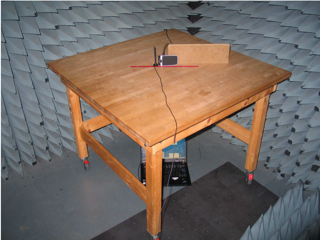
Photo 3: Test setup (Setup_a03) for radiated measurements (Enclosure, below 30 MHz)