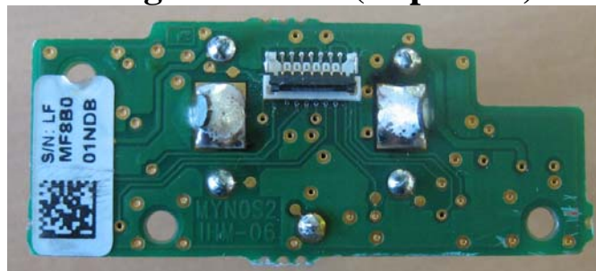
Daughter Board (Bottom View)