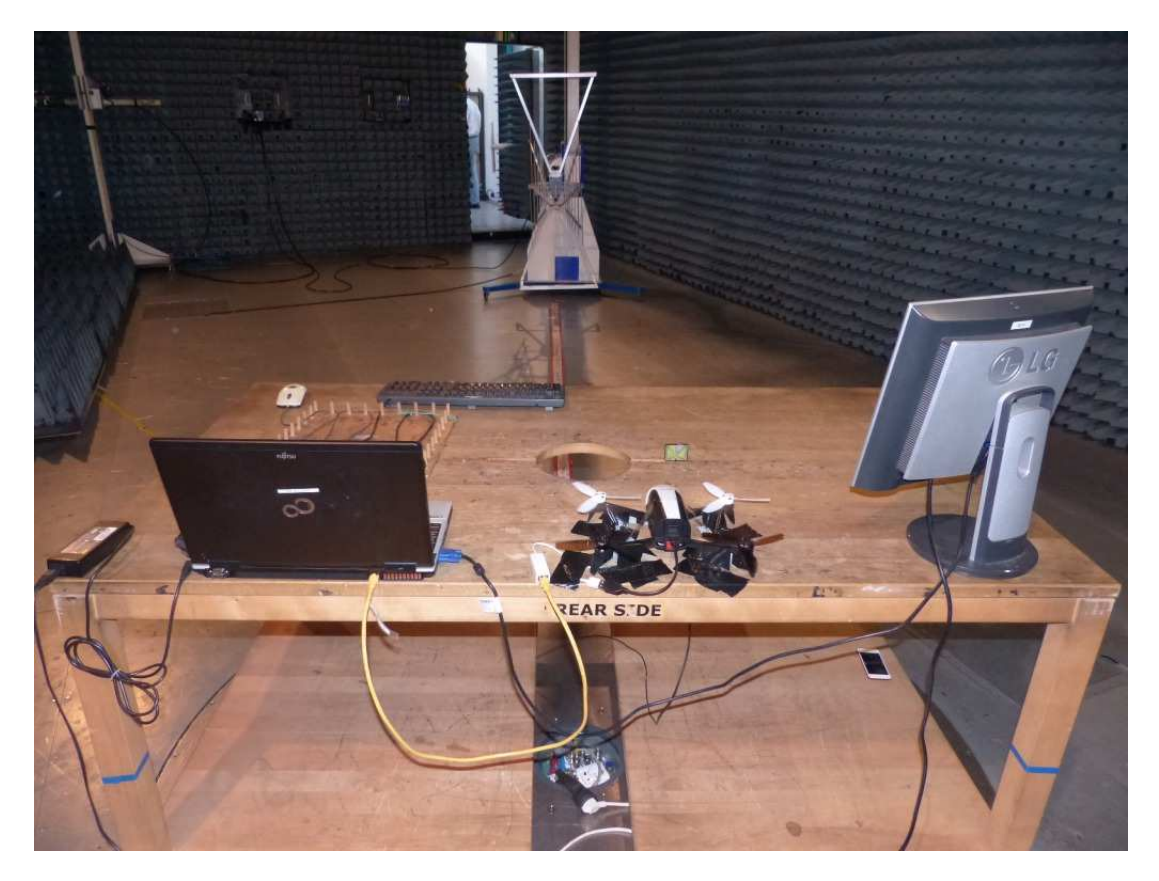
Photo 5: Test setup for radiated measurements (computer peripheral setup, EUT supplied by external DC power to enable USB data transfer to computer, unintentional radiator §15)