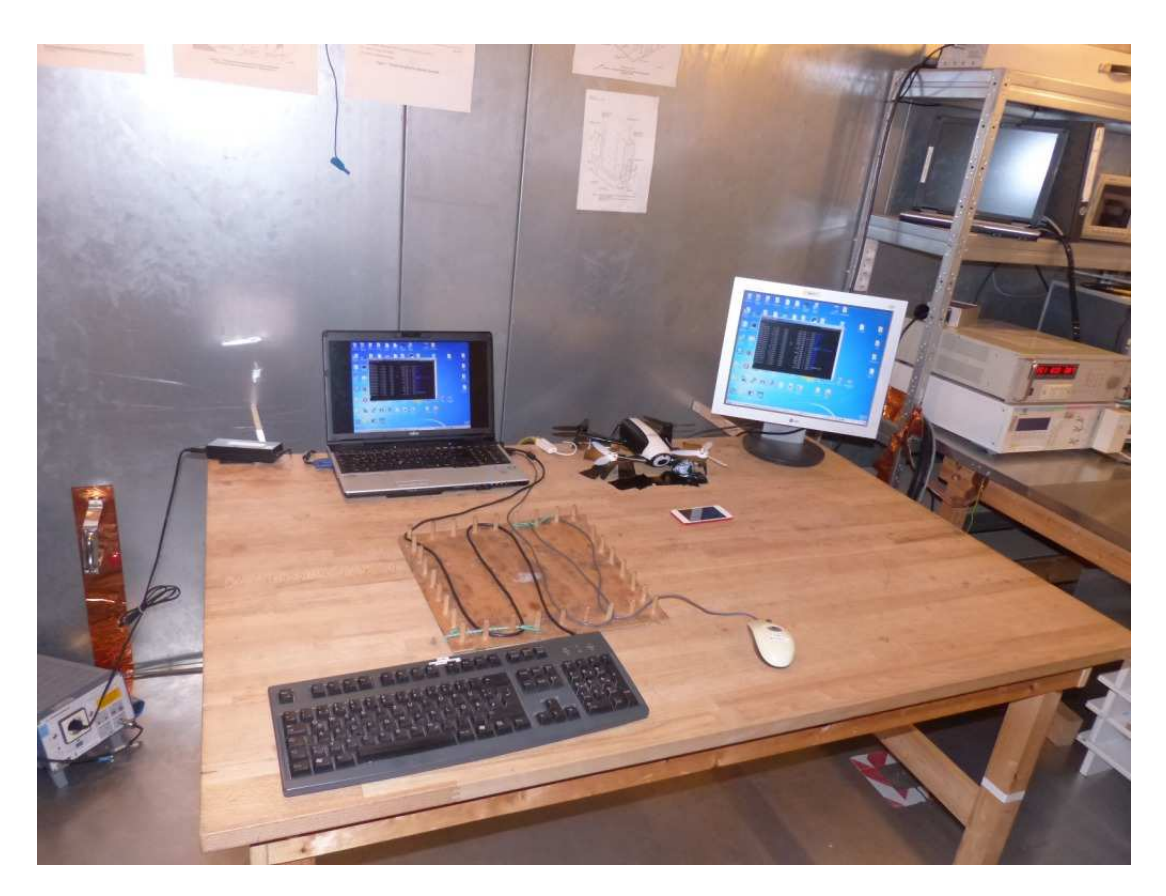
Photo 4: Test setup for conducted measurements (computer peripheral setup, EUT supplied by USB-cable from computer, charging mode, unintentional radiator §15)