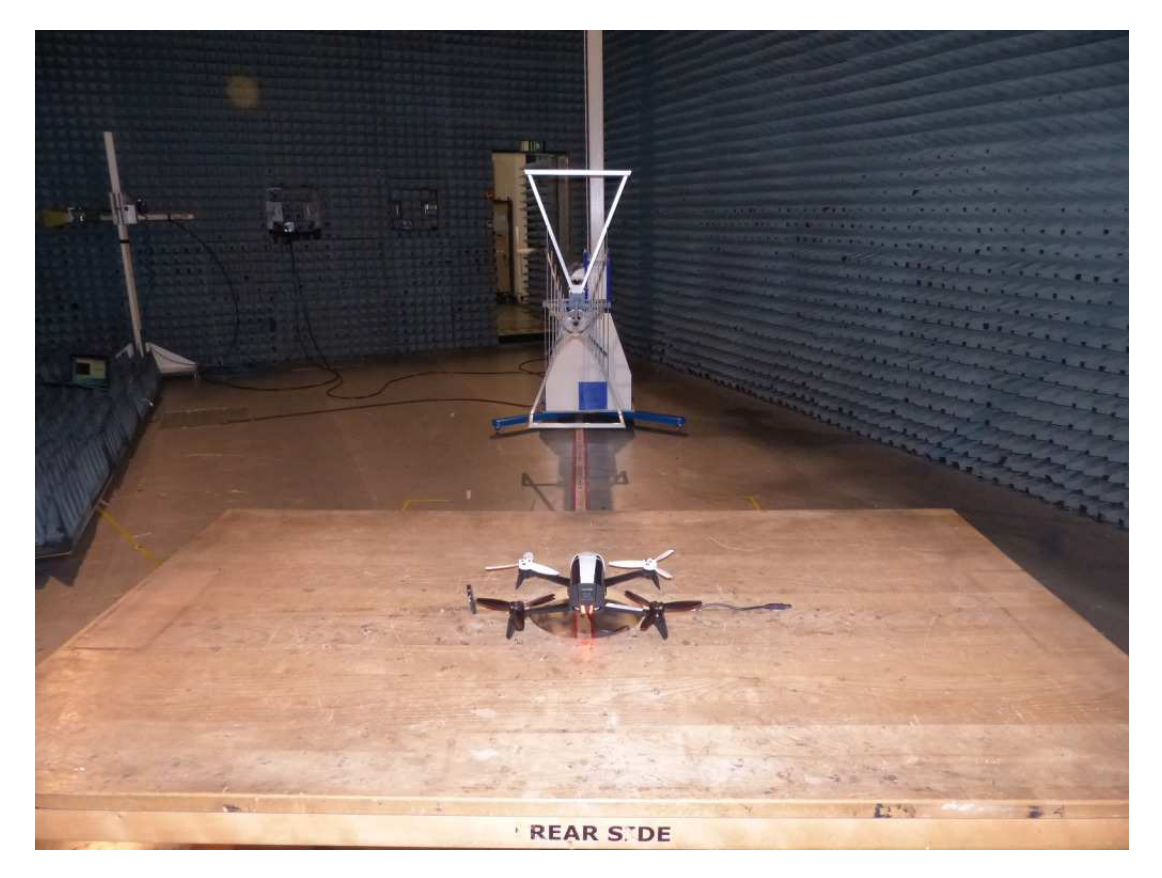
Photo 2: Test setup for radiated measurements (Enclosure, semi-anechoic chamber, 30 MHz to 1 GHz, intentional radiator §15)