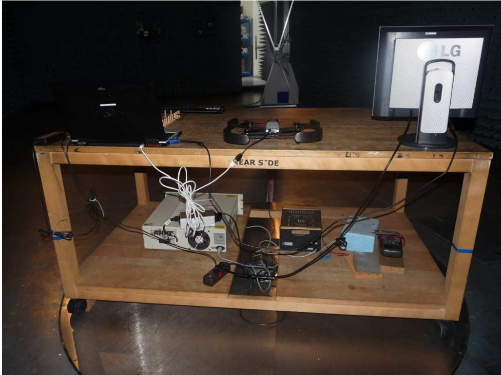
Photo 6: Test setup for radiated measurements (computer peripheral setup, EUT supplied by external DC power to enable USB data transfer to computer, unintentional radiator §15)