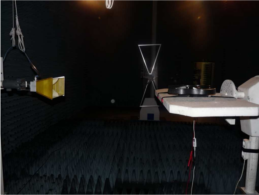
Photo 3: Test setup for radiated measurements (Enclosure, fully-anechoic chamber, 1-18 (15) GHz intentional radiator §15)