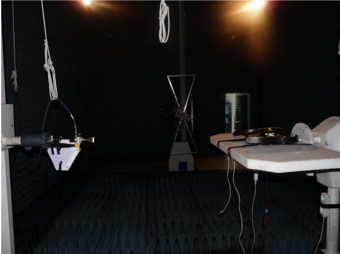
Photo 4: Test setup for radiated measurements (Enclosure, fully-anechoic chamber, 18-25 GHz, intentional radiator § 15.247)