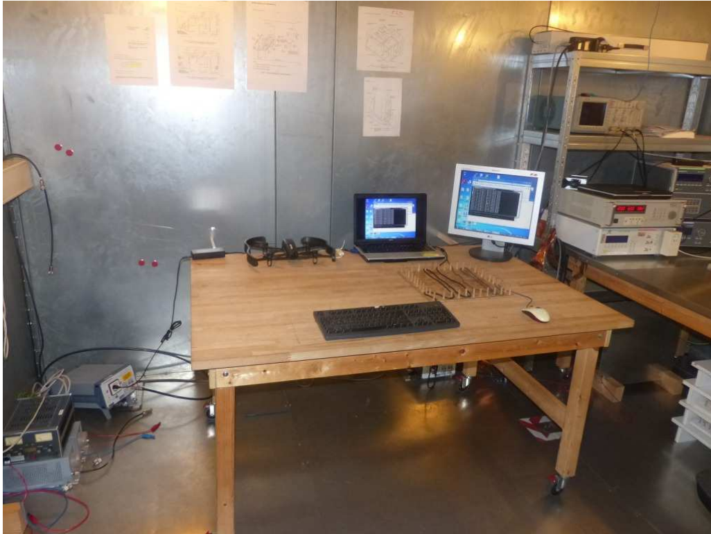
Photo 5: Test setup for conducted measurements (computer peripheral setup, EUT supplied by USB-cable from computer, charging mode, unintentional radiator §15)