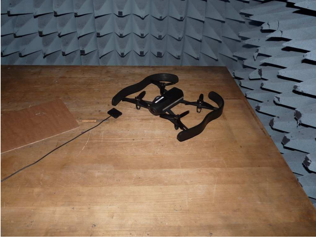
Photo 1: Test setup for radiated measurements (Enclosure, below 30 MHz, intentional radiator §15)