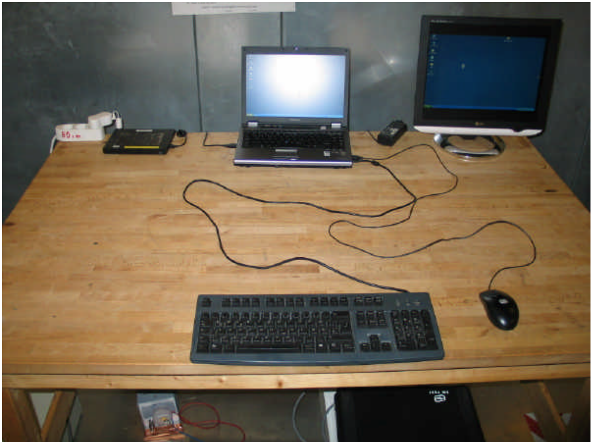
Photo 4: Test setup for conducted measurements (AC Port (power line))