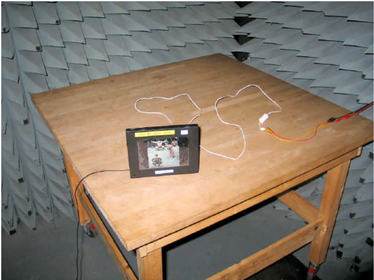
Photo 2: Test setup for radiated measurements (Enclosure, below 30 MHz)