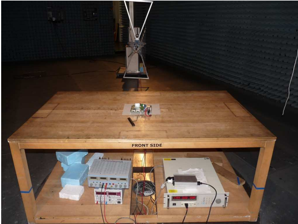
Photo 2: Test setup for radiated measurements (30 MHz to 1 GHz), FCC 15.247