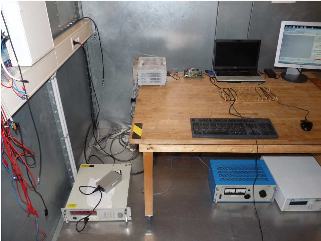
Photo 4: Test setup for conducted emissions measurements (150 KHz to 30 MHz), FCC 15.247 Module with external Antenna