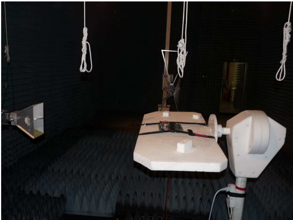
Photo 3: Test setup for radiated measurements (above 1 GHz), FCC 15.247