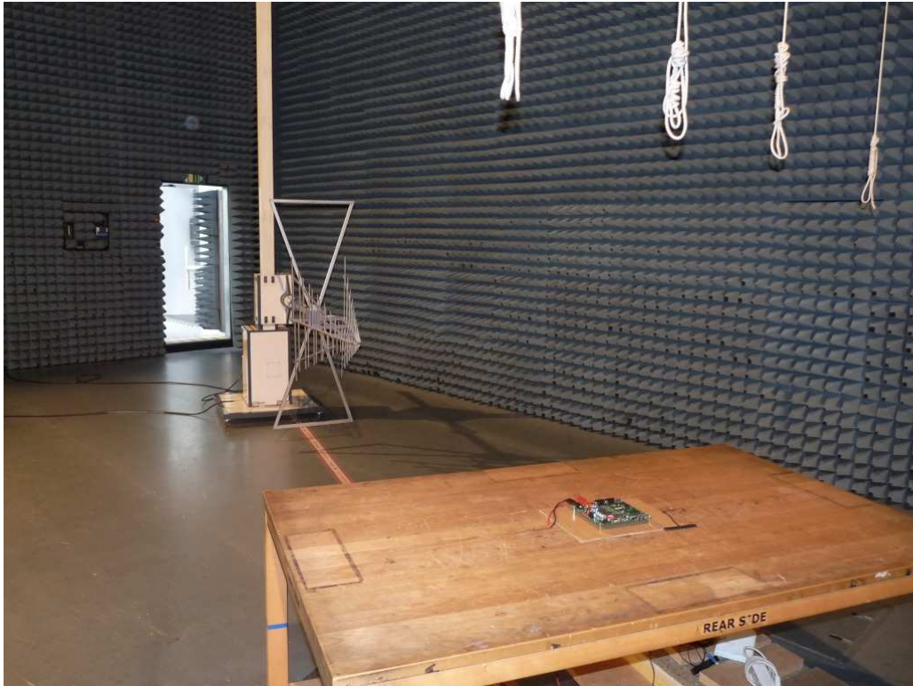
Photo 2: Test setup for radiated measurements (30 MHz to 1 GHz), FCC 15.247