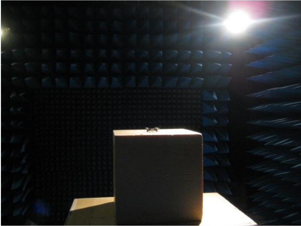
Radiated emission anechoic room