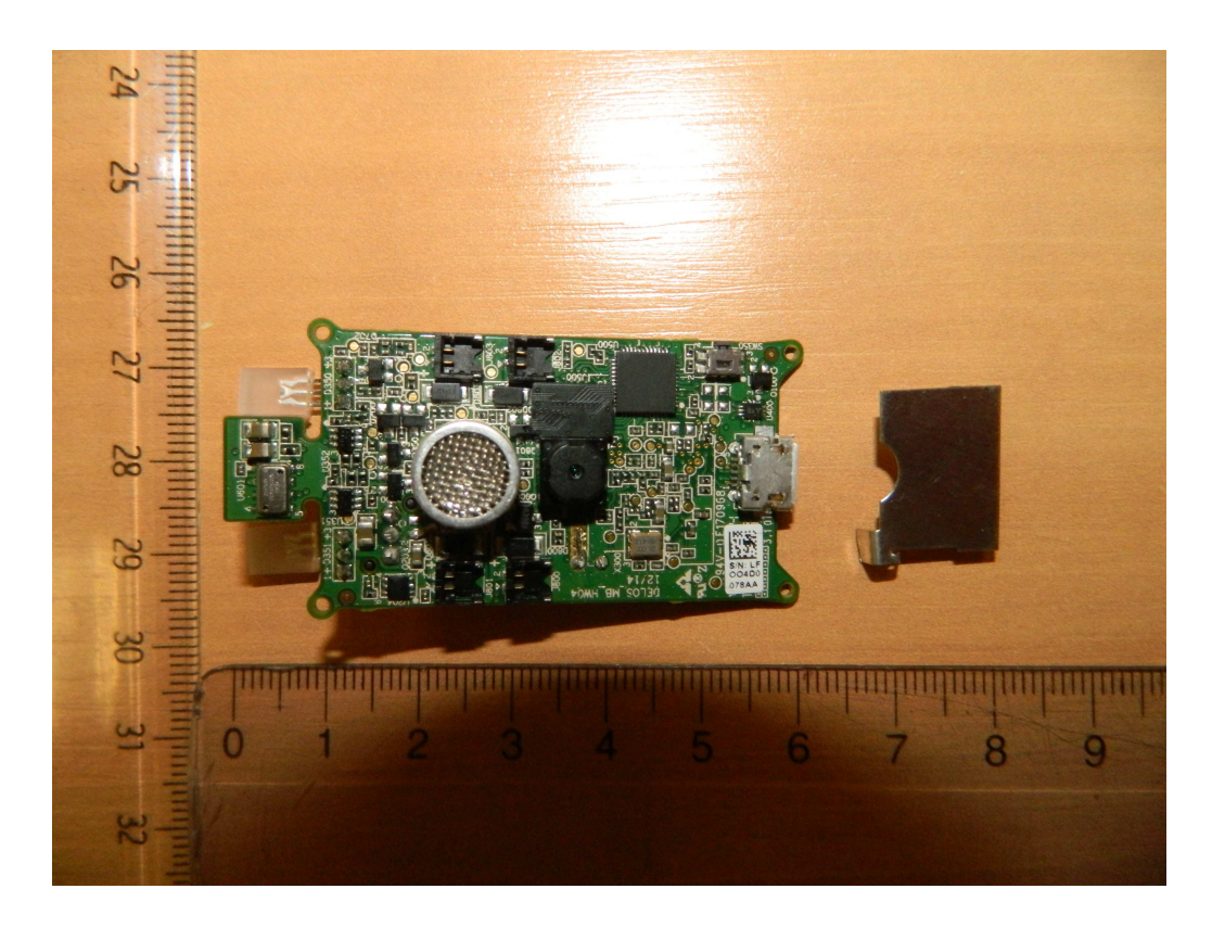
Board without shield (Bottom)