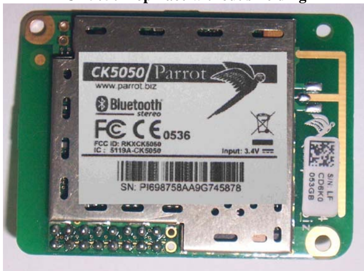
CK5050-Top Face with shielding