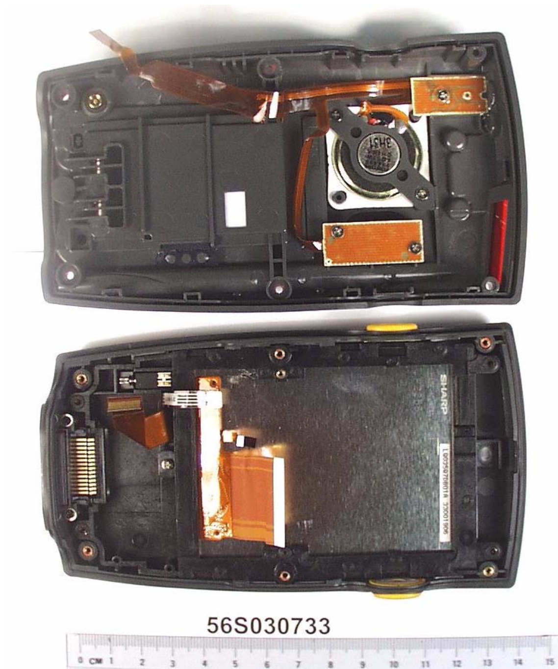
Internal View 2