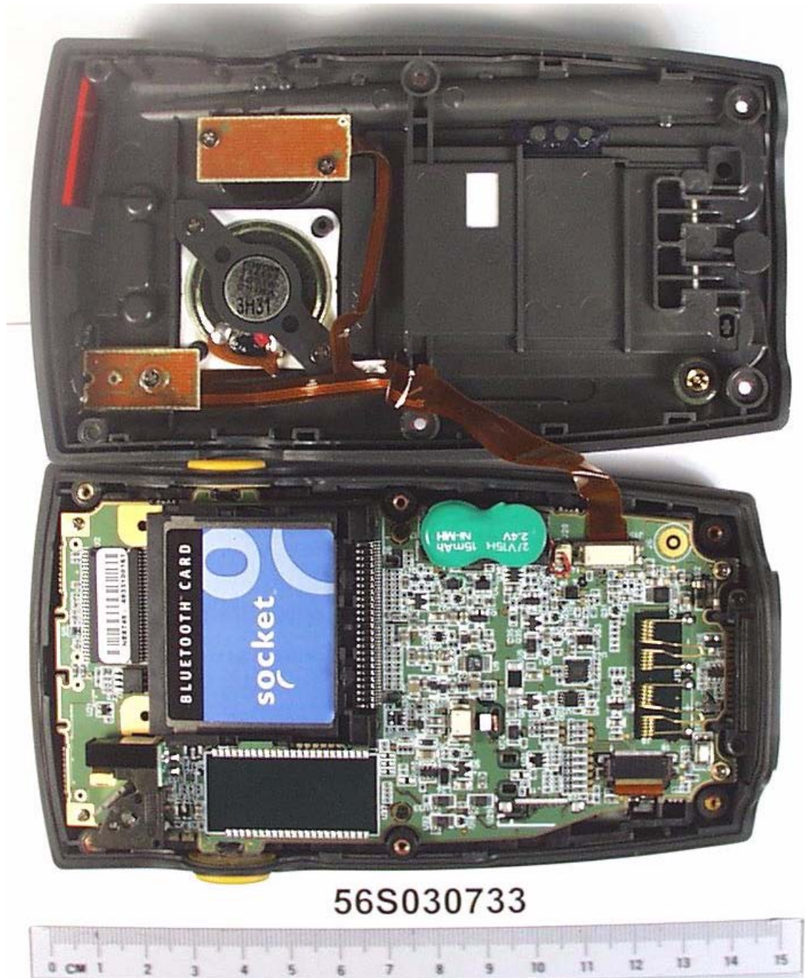
Internal View 1