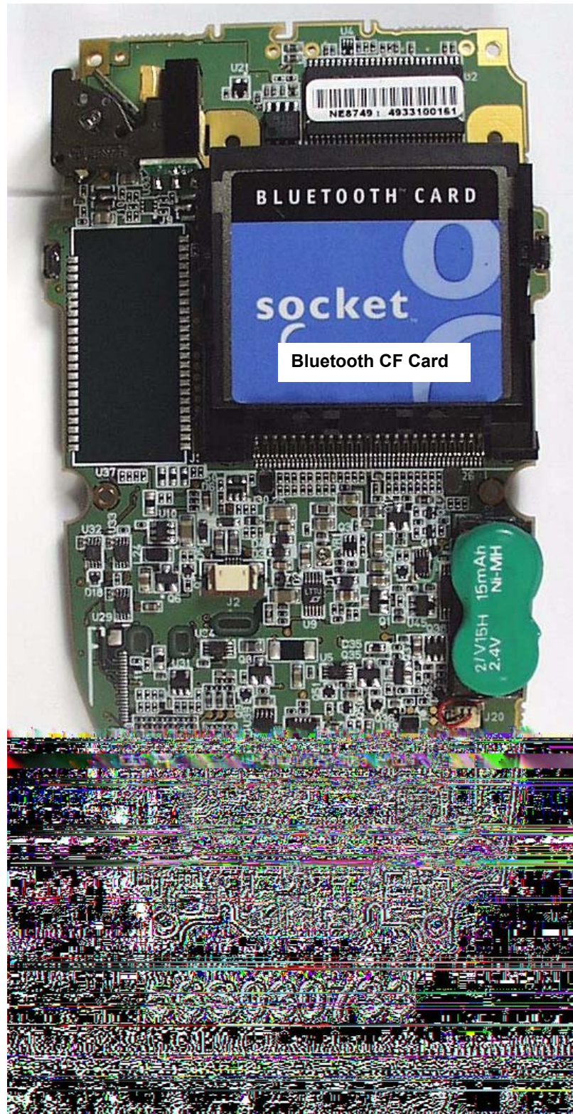
EUT PCB View 1