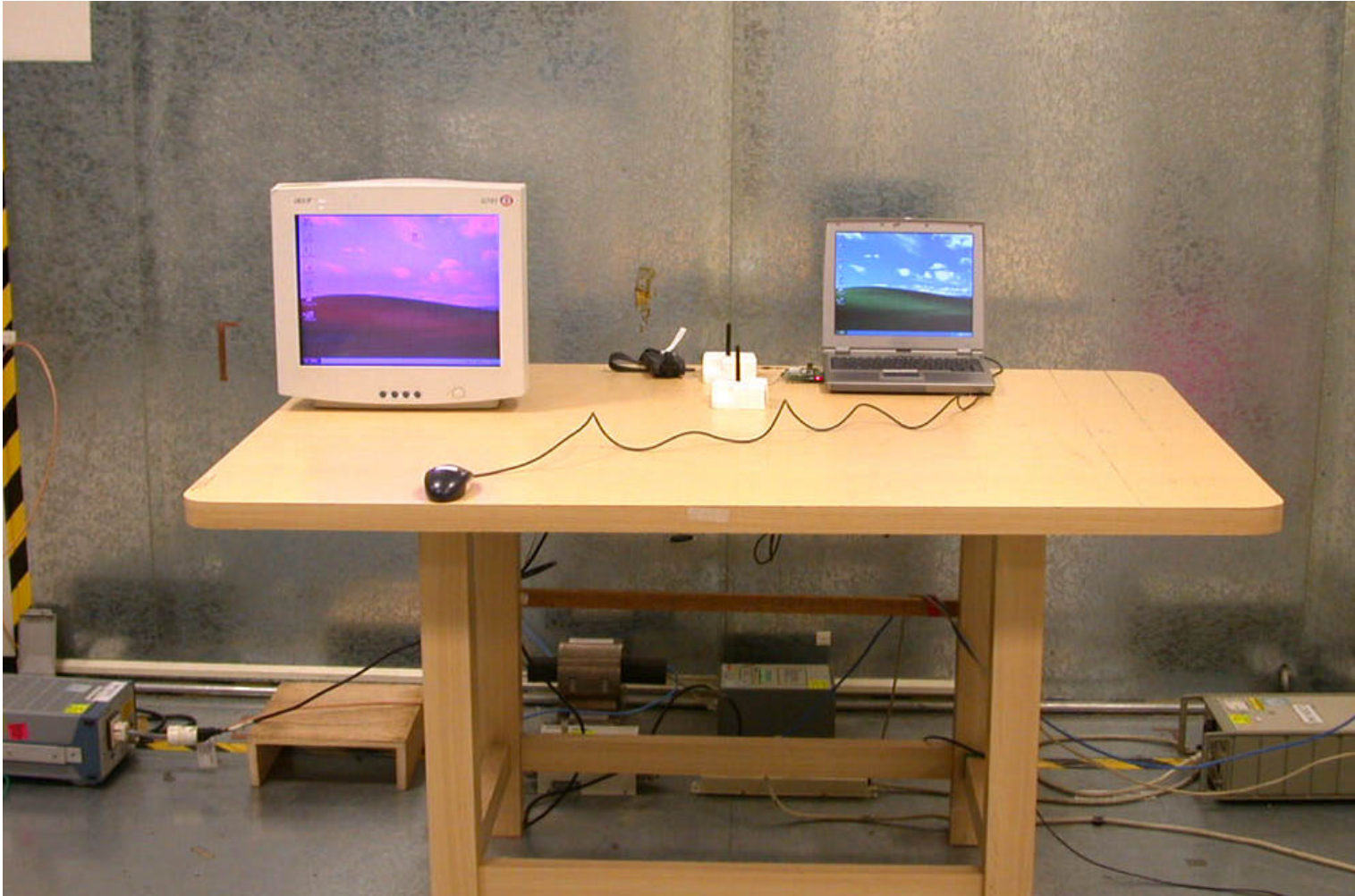
The Front View of Highest Conducted Set-up For EUT