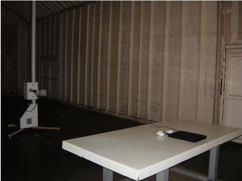
Back View of Radiated Test (Horn) - PIFA