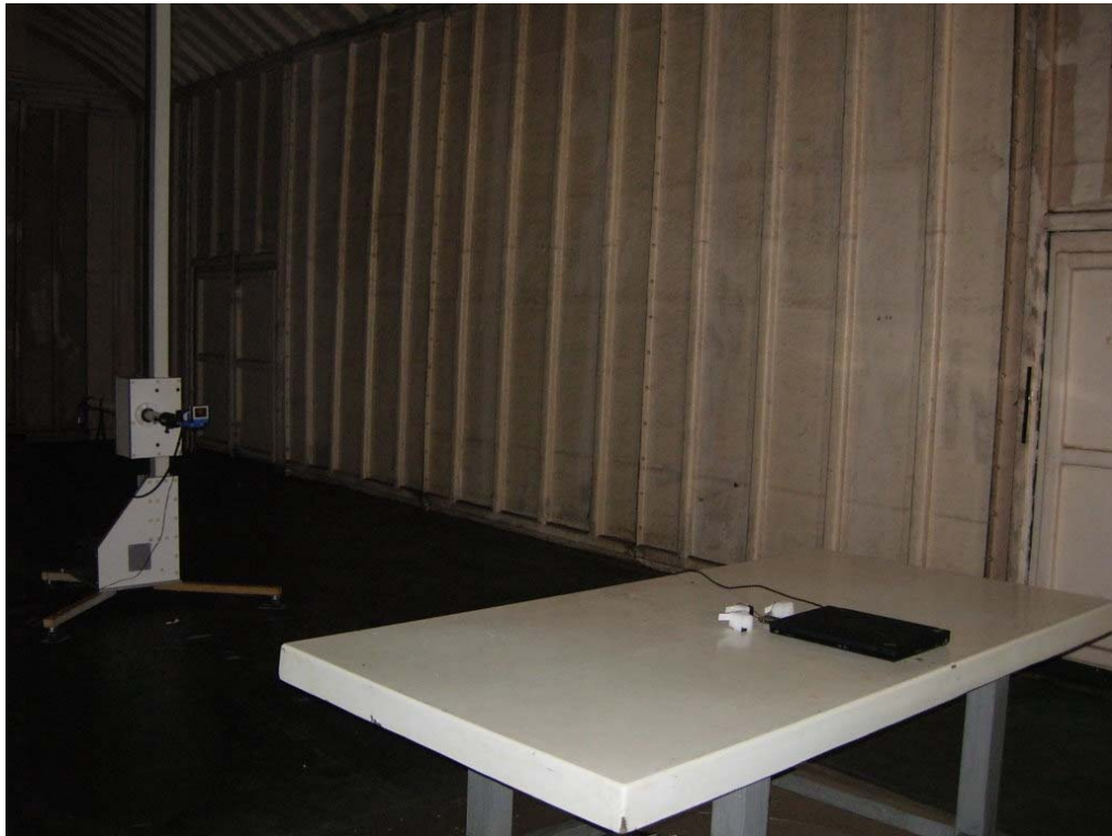
Back View of Radiated Test (Horn) - PIFA