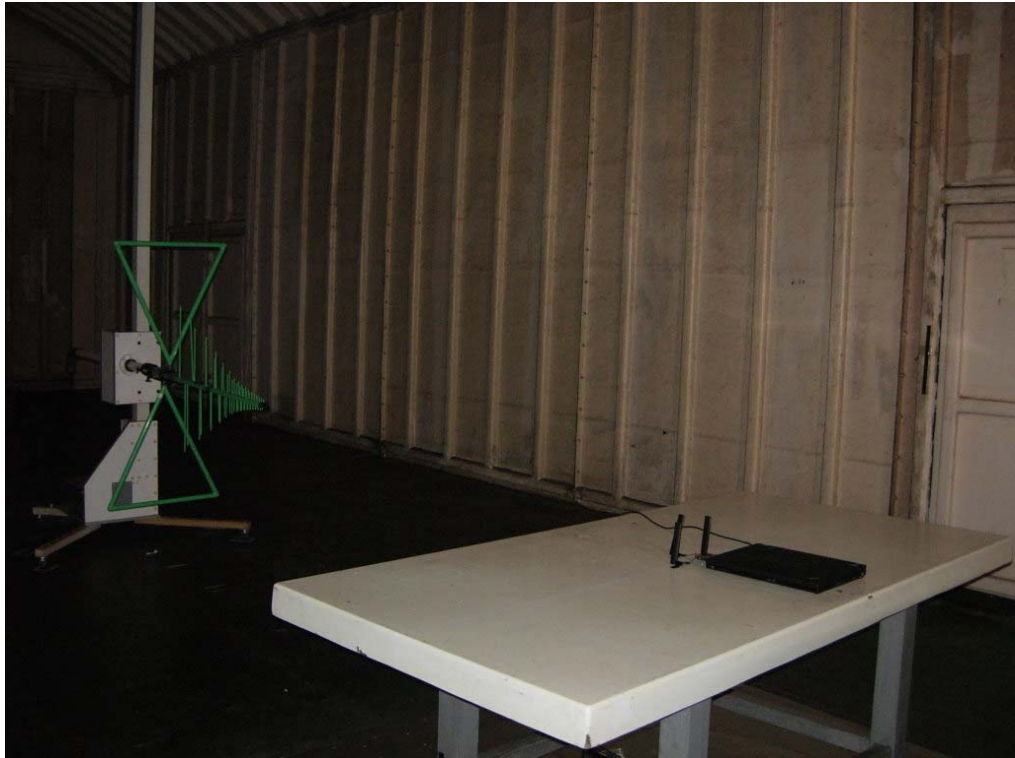
Back View of Radiated Test - Dipole