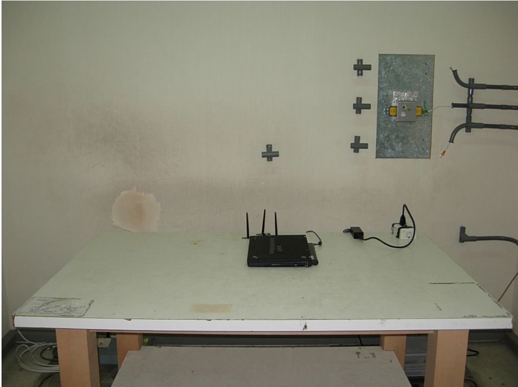
Back View of Conducted Test - Dipole