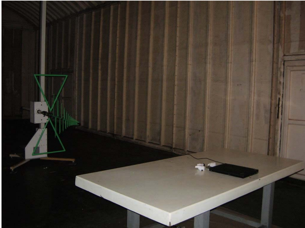
Back View of Radiated Test - PIFA