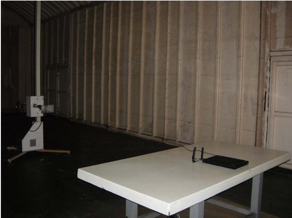
Back View of Radiated Test (Horn) - Dipole