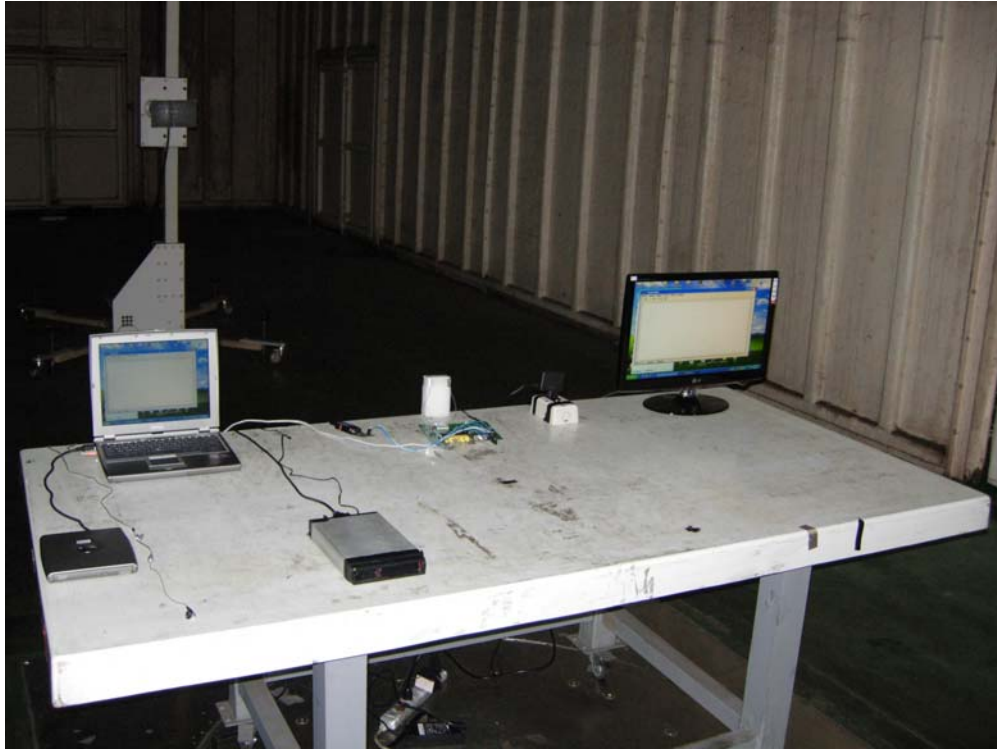
Back View of Radiated Test (Horn) (PIFA)