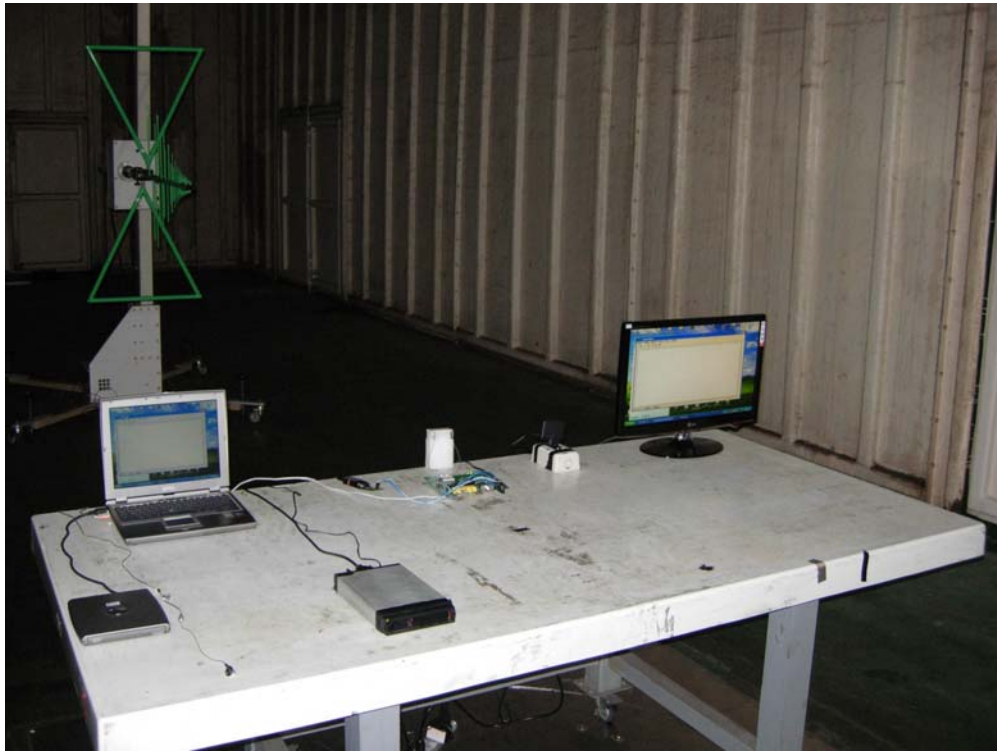
Back View of Radiated Test (PIFA)