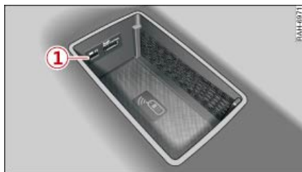
Fig. 23 Audi phone box

With the Audi phone box* and a USB adapter cable for your cell phone, you can make calls through the vehicle antenna and charge your cell phone. Using the external antenna helps when there is low signal strength and also provides better reception quality. The Audi phone box is located in the center console under the center armrest.