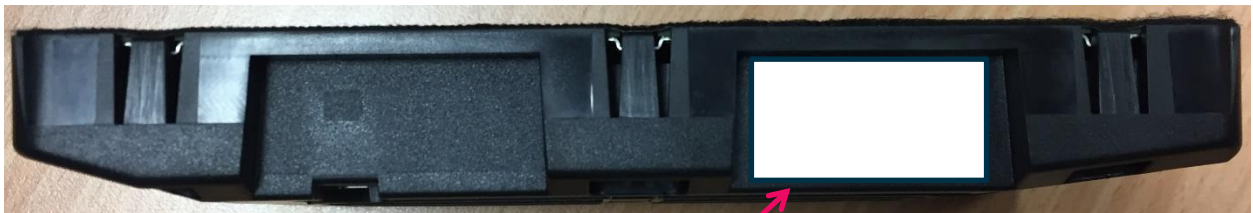
Position of the main type label