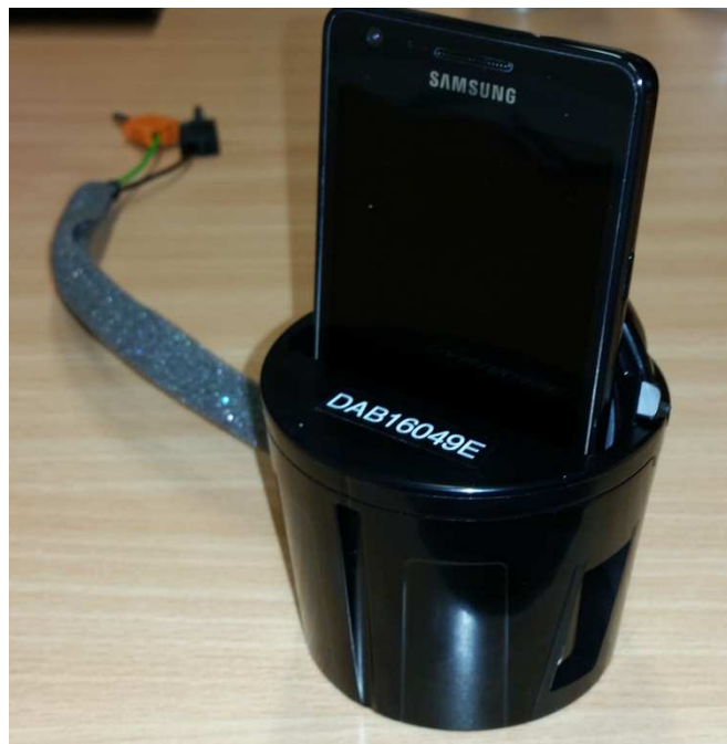
View with mobile phone inserted (normal use case)