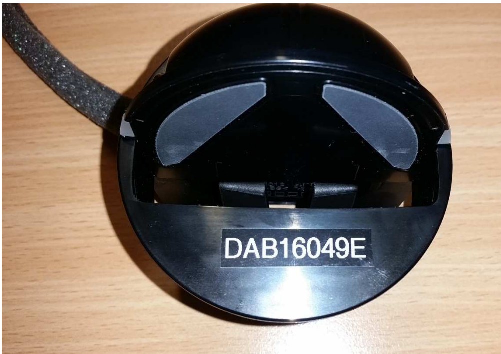
Top View with insertion slide-in for wireless power receiver (e.g. mobile phone)