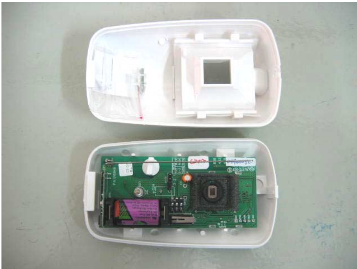
Photograph No.1 Passive infrared detector Internal view