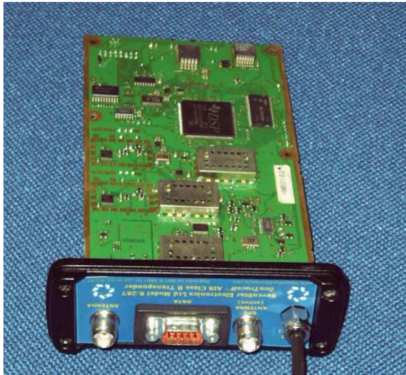
Fig 1 - Showing Underside of PCB Assembly And Rear Panel