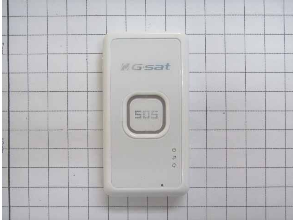
Fig.5 Front view of EUT