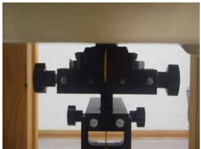
Fig.4 Put the EUT into holster and back side of EUT is paralleled with flat phantom, holster is paralleled and contacted with flat phantom.