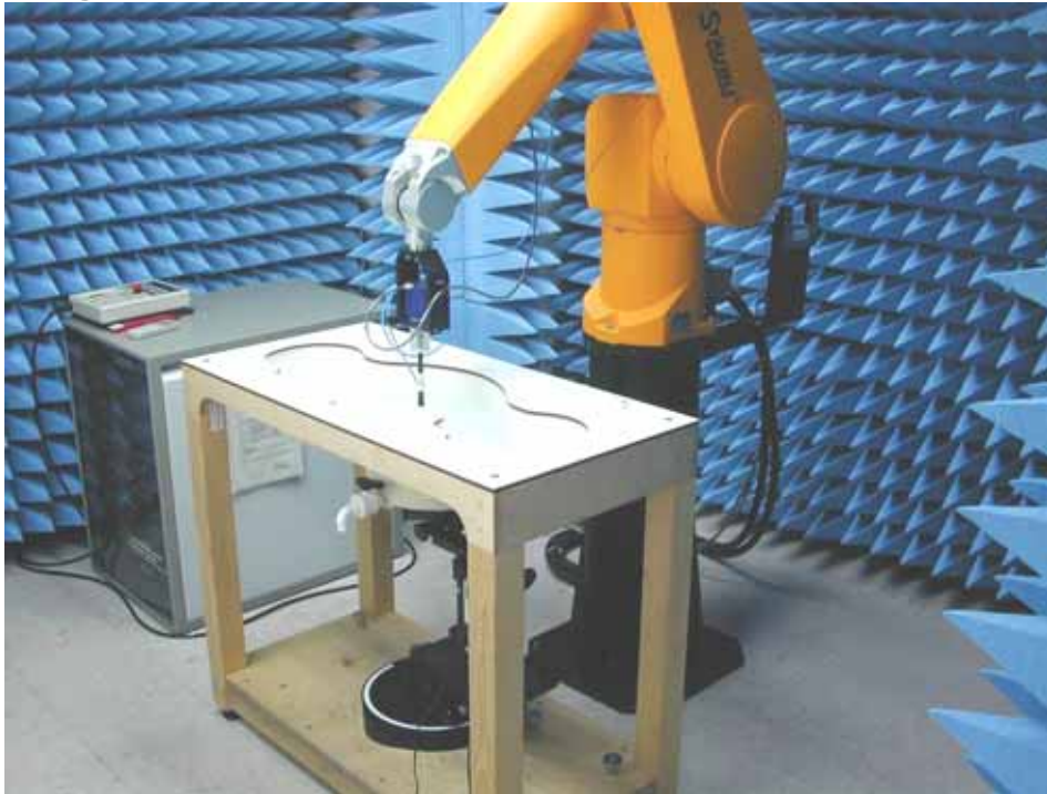
Fig.1 Photograph of the SAR measurement System