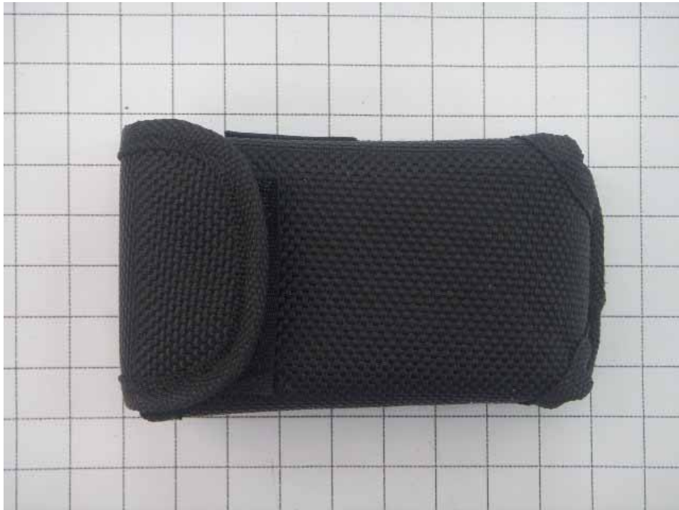
Fig.11 Front view of Holster