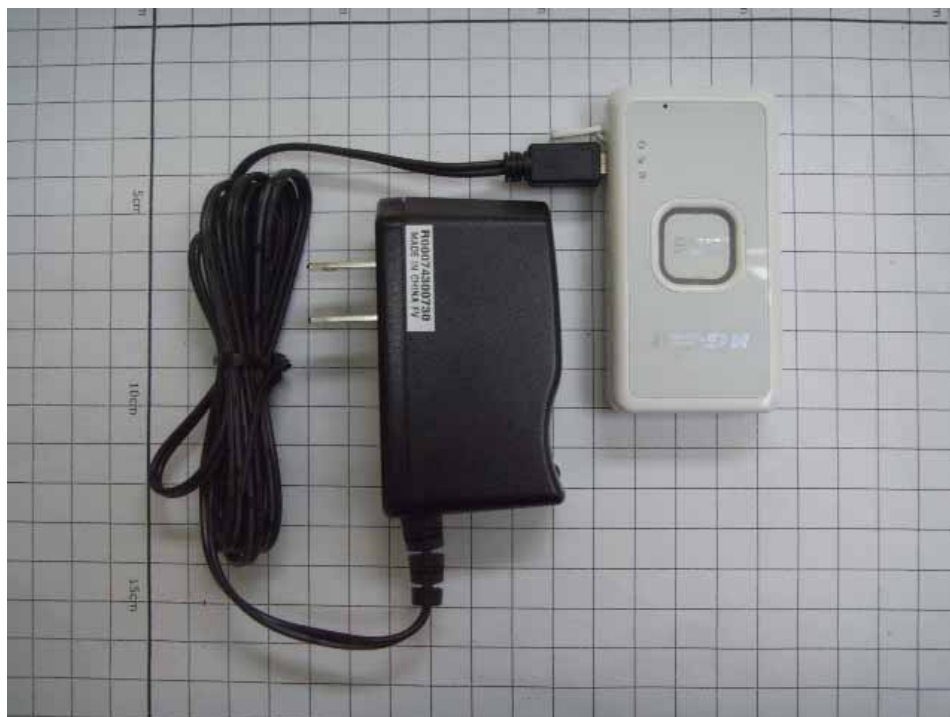
Fig.9 AC charger