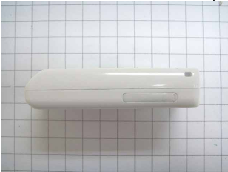
Fig.7 Left Side of EUT