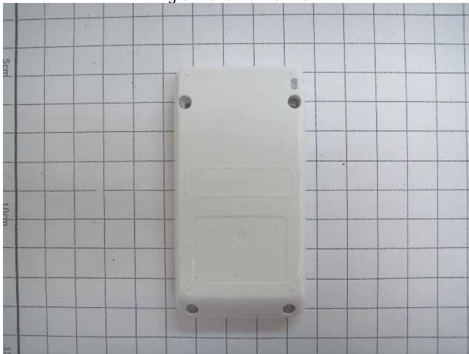
Fig.6 Back view of EUT