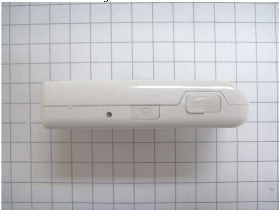
Fig.8 Right Side of EUT