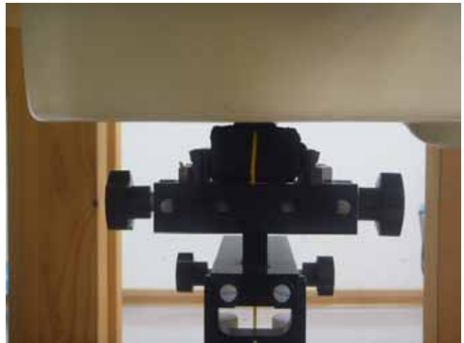
Fig.3 Put the EUT into holster and front side of EUT is paralleled with flat phantom, holster is paralleled and contacted with flat phantom.