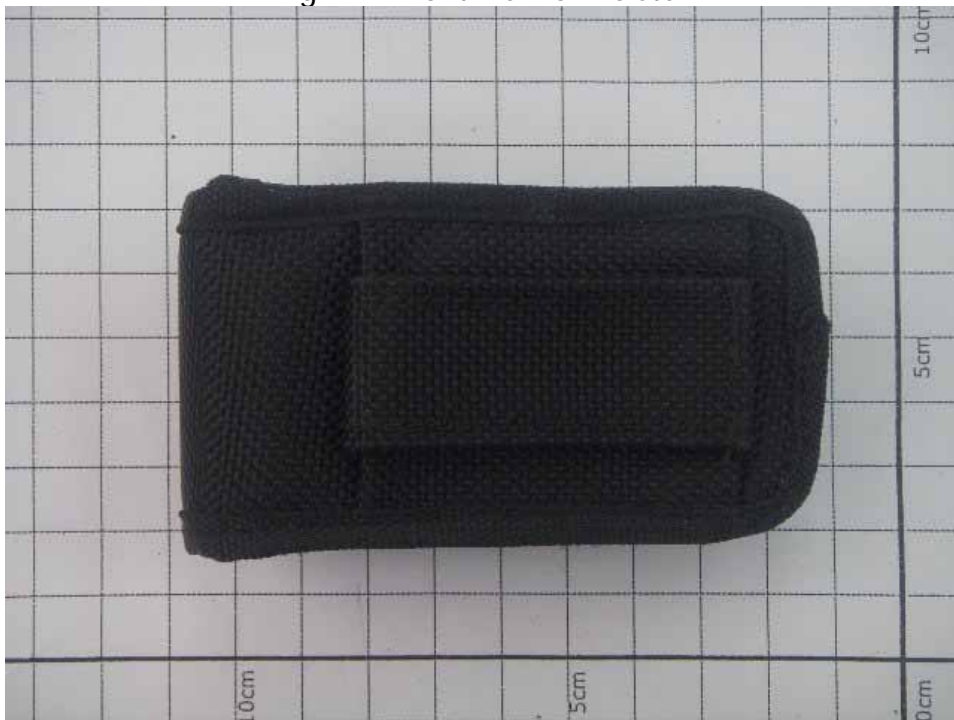
Fig.12 Back view of Holster