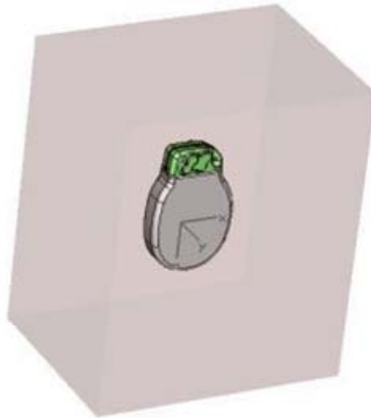
Figure 1 Device placed inside a parallelepiped of muscle. Displayed is also XYZ coordinate system

the much lower conductivity and dielectric constant of fat. The boundary condition Perfect Electrical Conductor (PEC) was used. The reason for using PEC was to safeguard that all emitted energy was kept within the computational volume. The validity of the chosen parallelepiped is verified in Figure 3, where it is found that the energy relevant for the SAR calculation is dissipated in a distance much shorter than the distance to the boundary condition. The IMD metal parts were all modeled as PEC. This is a worst case scenario since a PEC conductor is lossless and hence does not reduce SAR as would a real metal conductor. The dielectrical materials implemented in the simulator are viewed in Table 1. The muscle electrical properties were retrieved from [4]. The electric properties were taken as mean value of transversal and parallel muscle fibers at 403 MHz. The density was chosen according to [5]. The materials used in the SAR calculations are all included as non-dispersive.