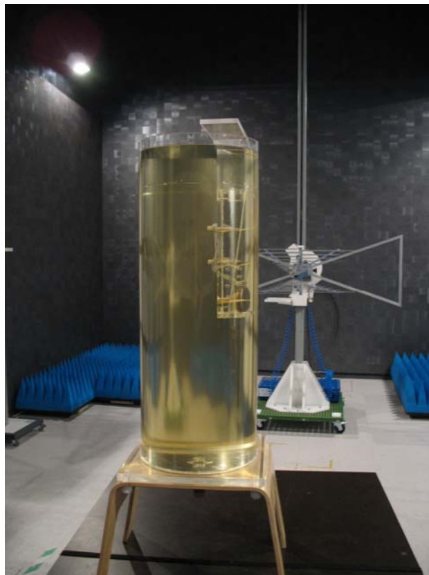
Test set-up, overview from EUT