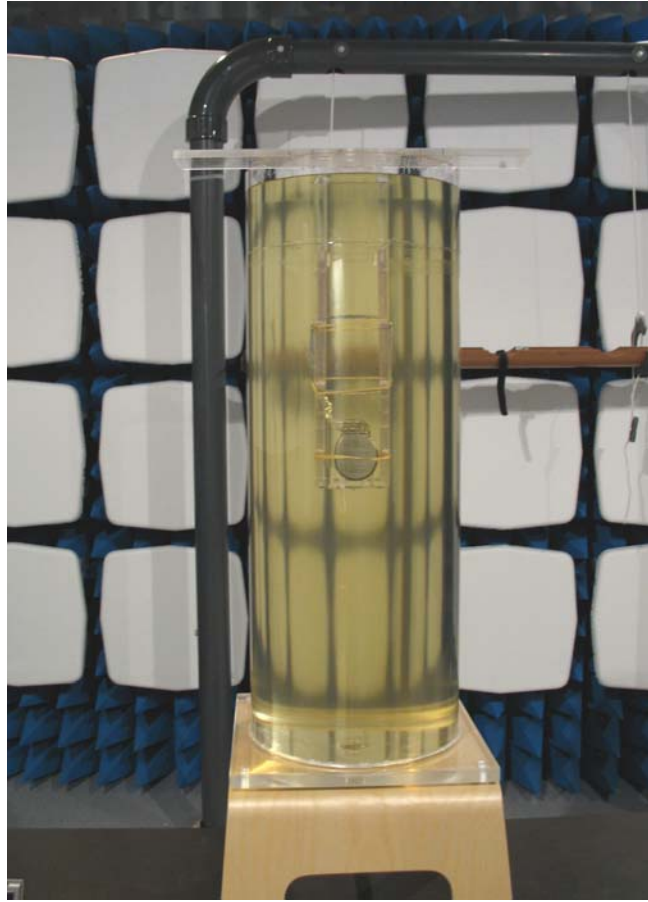
Test set-up, EUT in Plexiglas cylinder