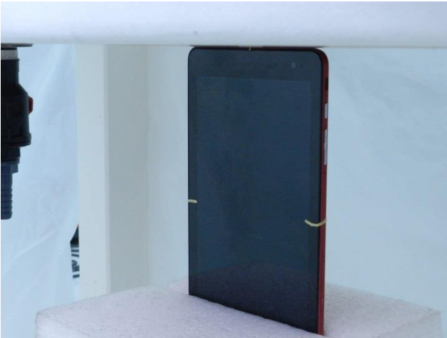
Edge1, Test Separation 0 cm