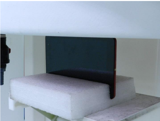
Edge2, Test Separation 0 cm