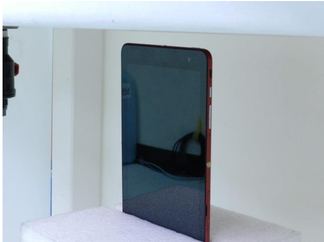
Edge1, Test Separation 1.3 cm