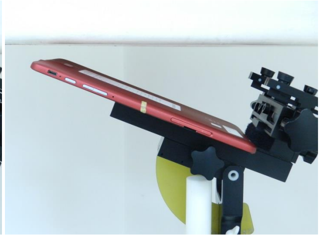
Curved surface of Edge1, Test Separation 0 cm