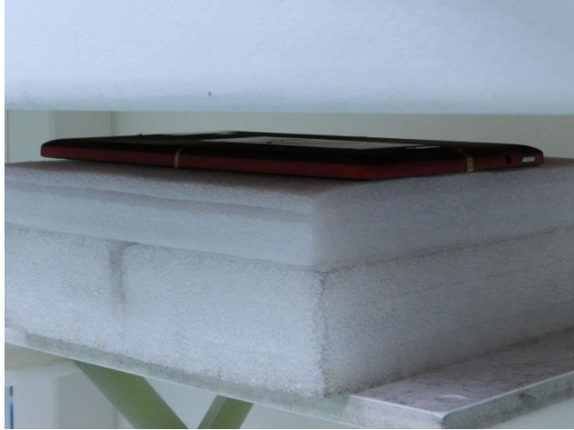
Bottom Face, Test Separation 1.5 cm