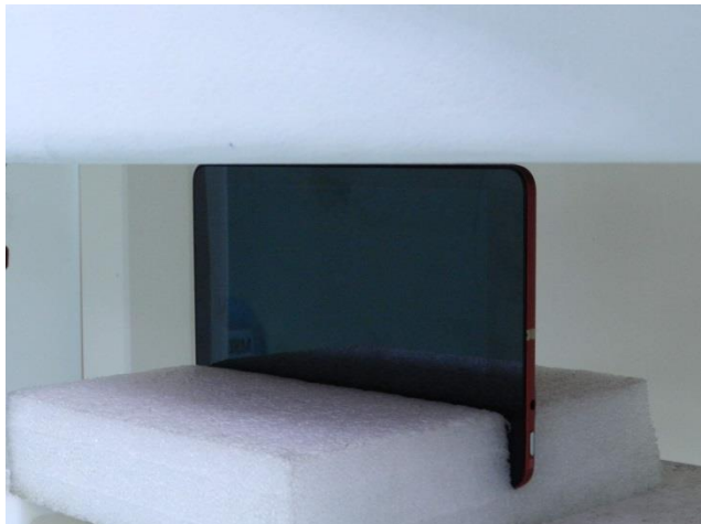
Edge4, Test Separation 0 cm