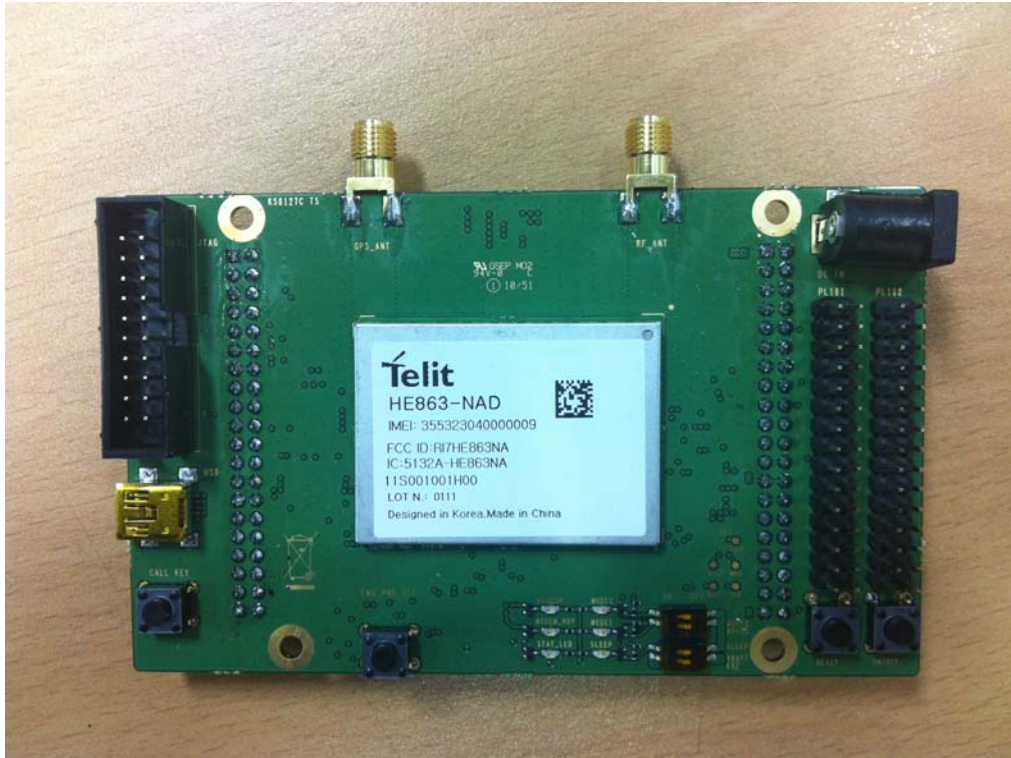
(2) Test Board Back Photo