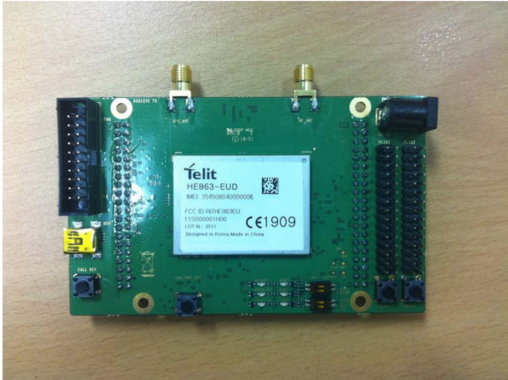
(2) Test Board Back Photo