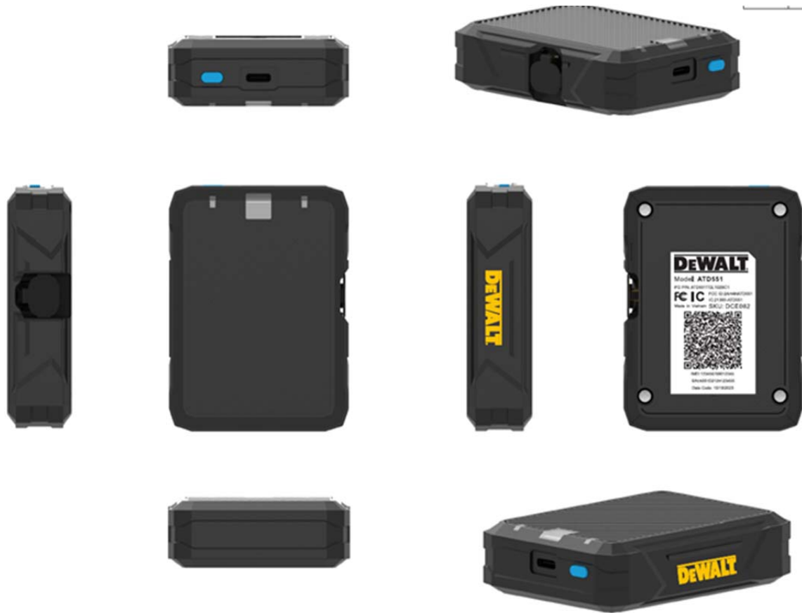
Figure 4: Example Location