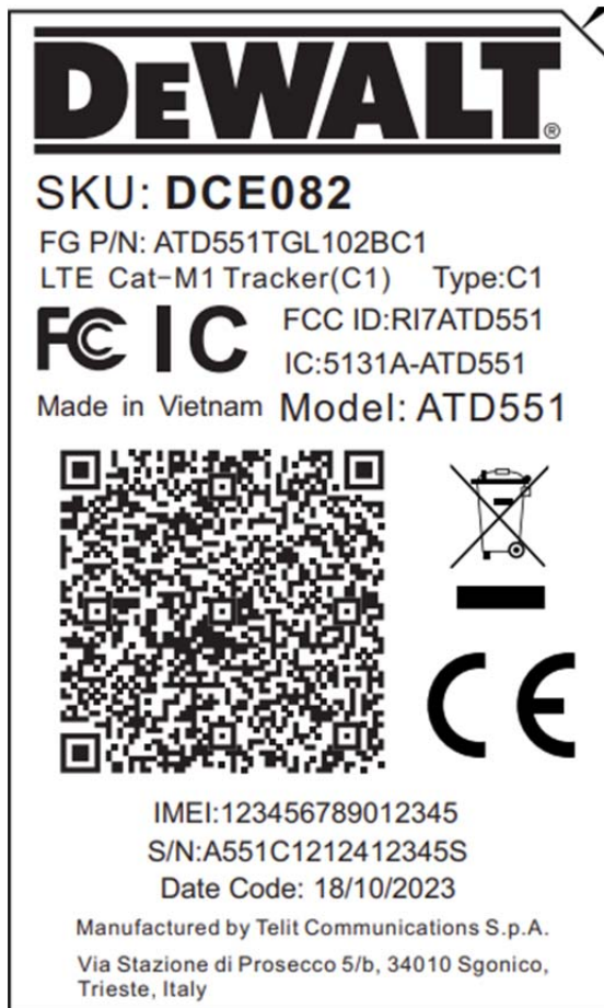
Figure 1: Product Label

On very first use, verify that the device's SN, IMEI listed on the box's label matches what is printed on the back of device.