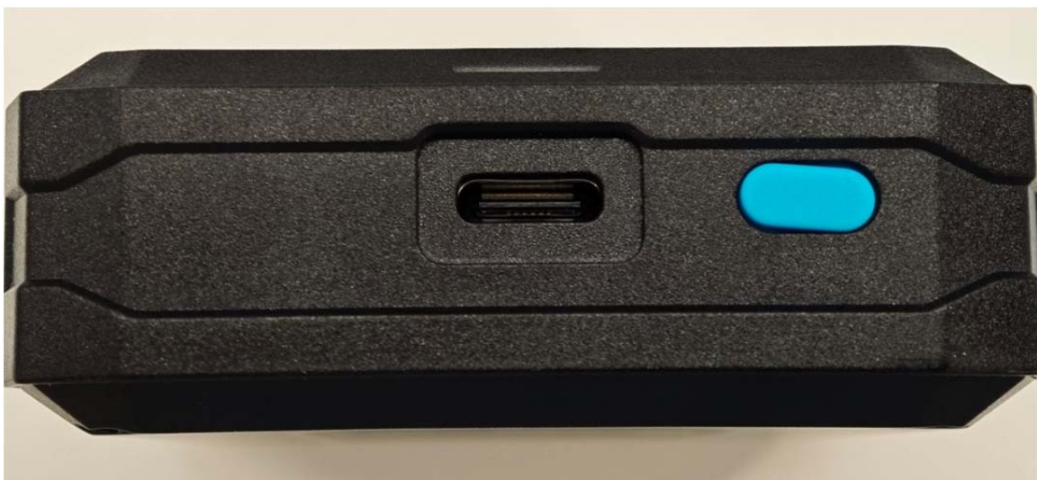
Figure 3: Button

The device is placed into “Set Up” mode at production. This is a low power mode where the device is dormant and requires user action to active. To determine whether the device is Active or in “Set Up” mode, pressing the device’s button down momentarily for one second or less. If the LED2 blinks once, the device is activated. If the LED2 blinks twice, the device is in “Set Up” mode, and will needs to be put into an active (Long press the button for more than 3 seconds).