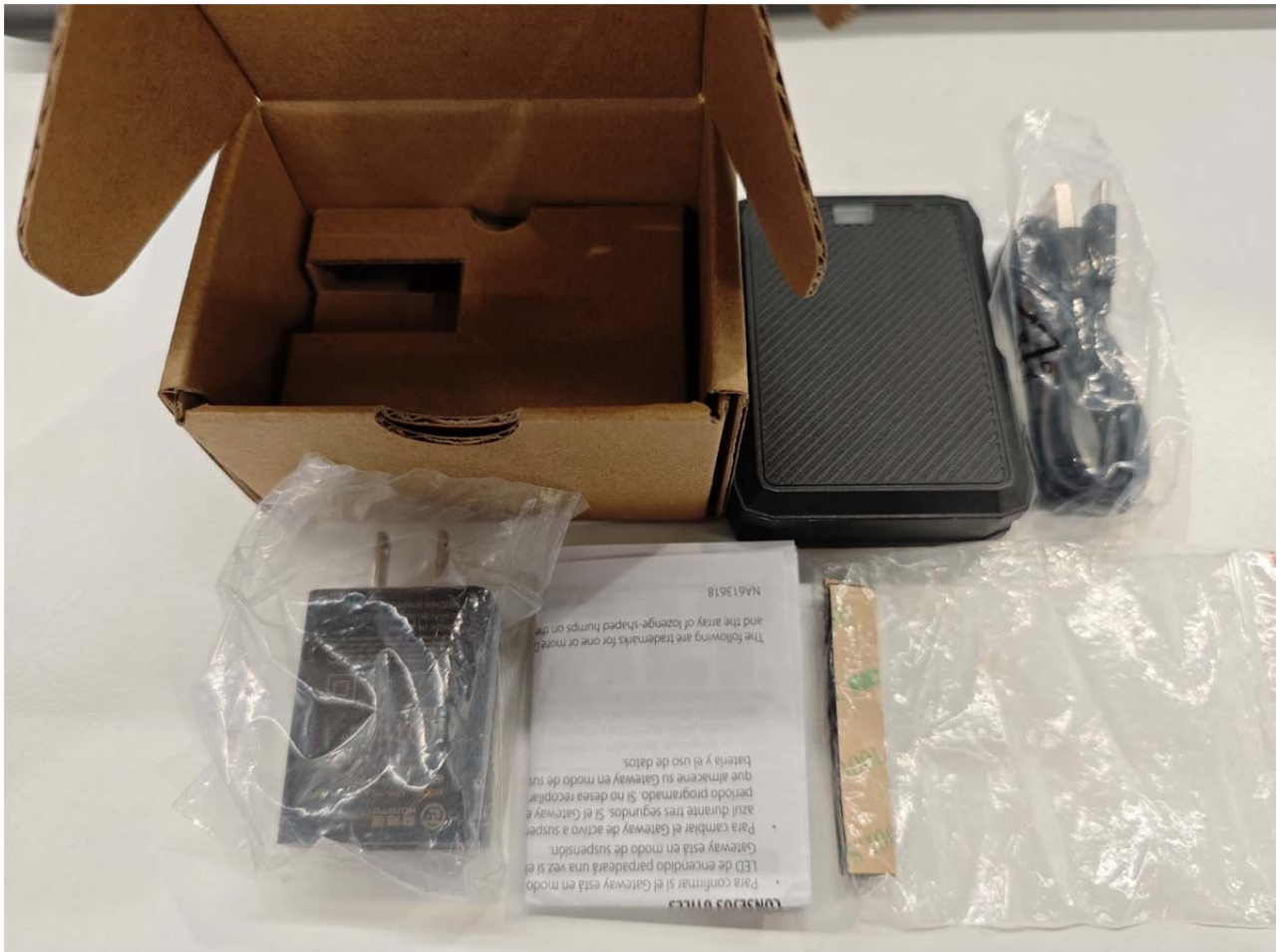
Figure 2: Device