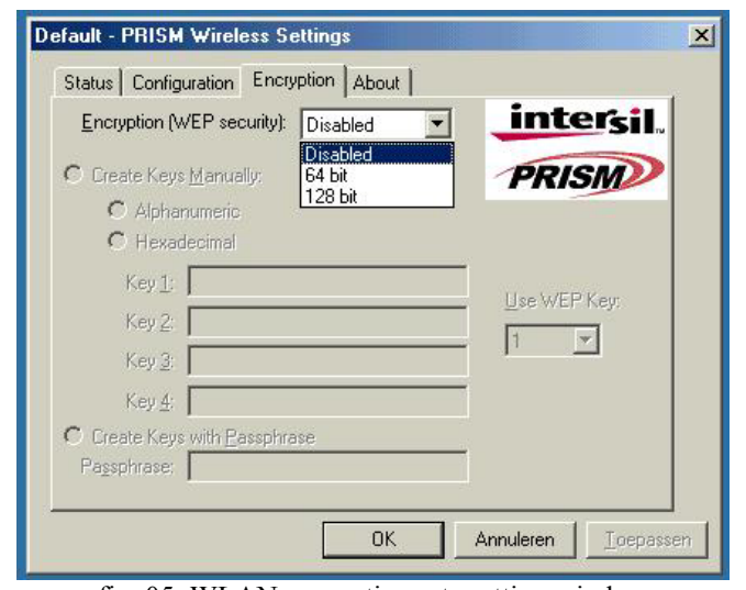
fig, 05: WLAN encryption rate setting window

h-select what encryption type is required, 64 or 128 bit WEP (default setting is disabled) see fig. 05.