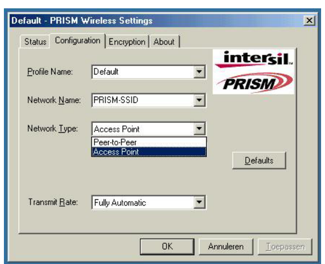
fig, 03: WLAN network type setting window

f-click on configuration tab and select which type of network is required (access point or Peer-to-peer mode), see fig. 03.