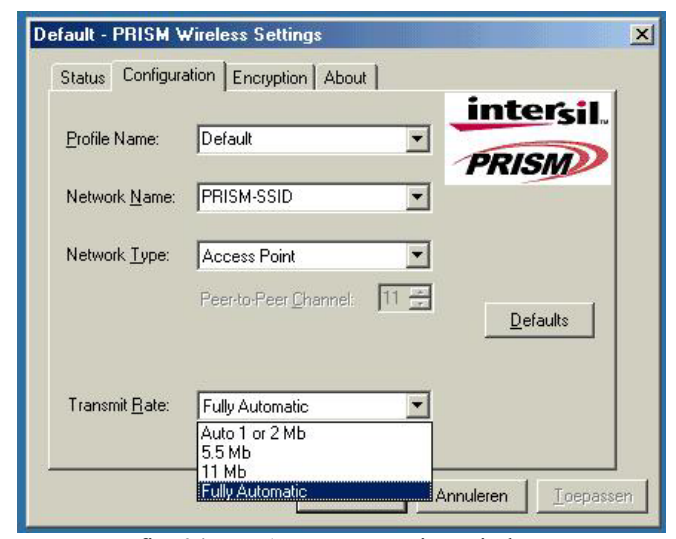
fig, 04: WLAN tx rate setting window

g-select what TX rate is required (default setting is fully automatic) see fig. 04.