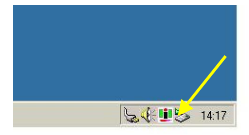
fig, 01: GlobespanVirata WLAN icon

d-the GlobespanVirata WLAN icon will appear in system tray on the bottom right of the screen (see yellow arrow in fig. 01)