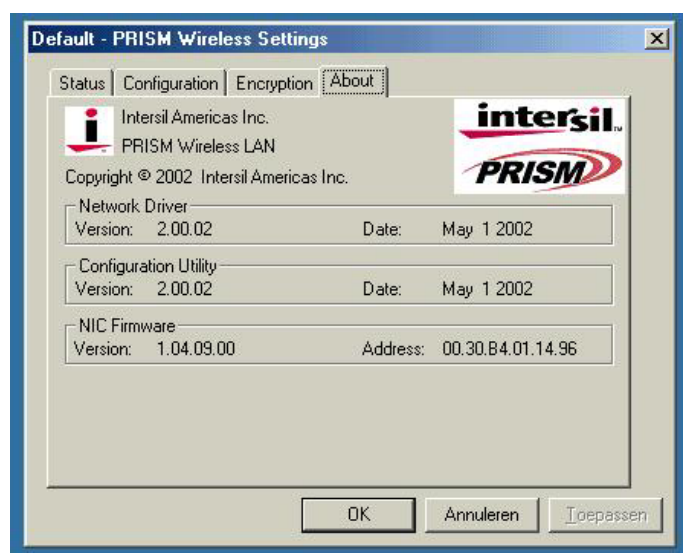
fig, 07: WLAN driver and MAC addres information

j-click on the about tab to see the software drivers versions and MAC address (fig.07).