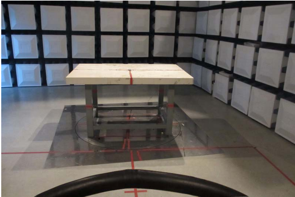
Radiated Measurement Photos 9K~30MHz