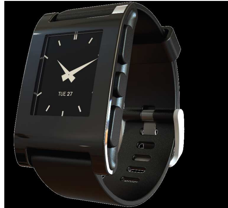
ID for reference only