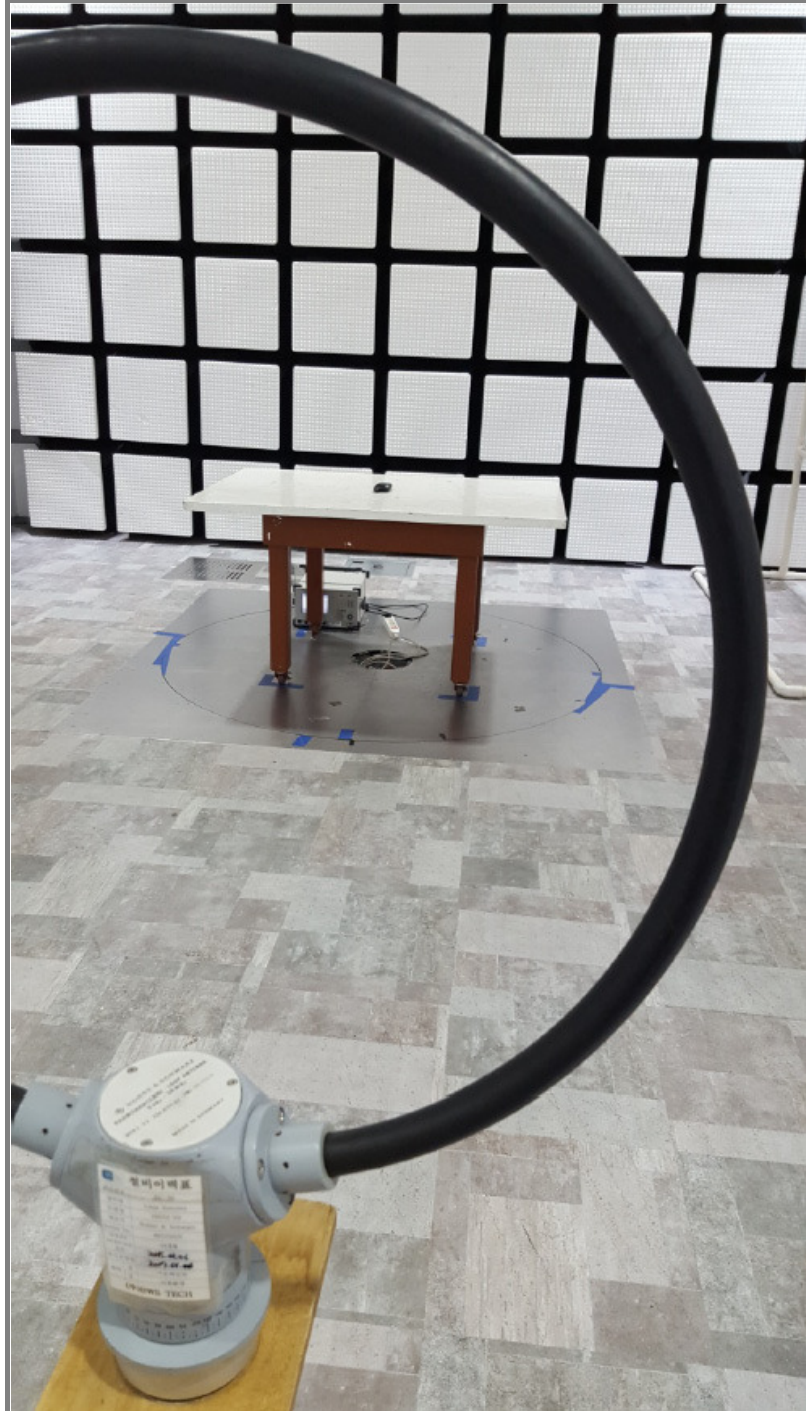
Photo of radiated spurious emission at below 30 MHz