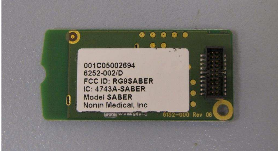
Figure 3 – Saber module PWBA (back) showing label