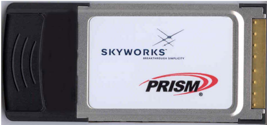
Skyworks Solutions Inc. Model: 32001A Back Label on Cover