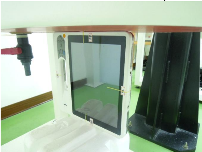
Primary Portrait with 0 cm Gap