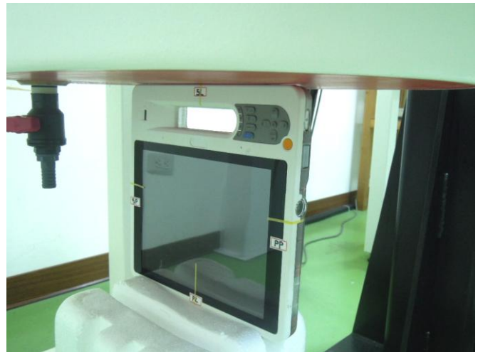
Secondary Landscape with 0 cm Gap