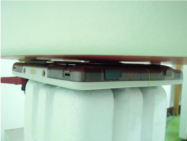
Rear Face of Tablet with 0 cm Gap