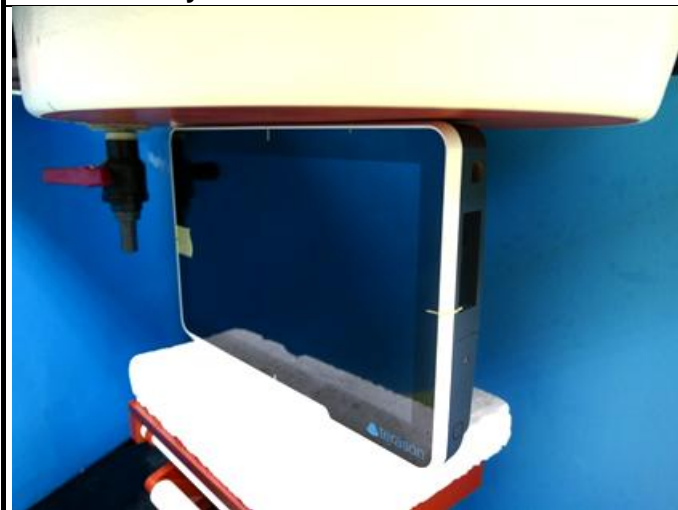
Body - Top Side of EUT at 0 mm