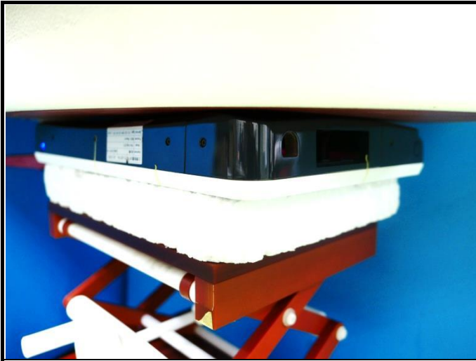
Body - Rear Face of EUT at 0 mm