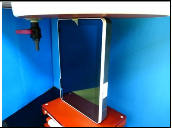
Body - Left Side of EUT at 0 mm