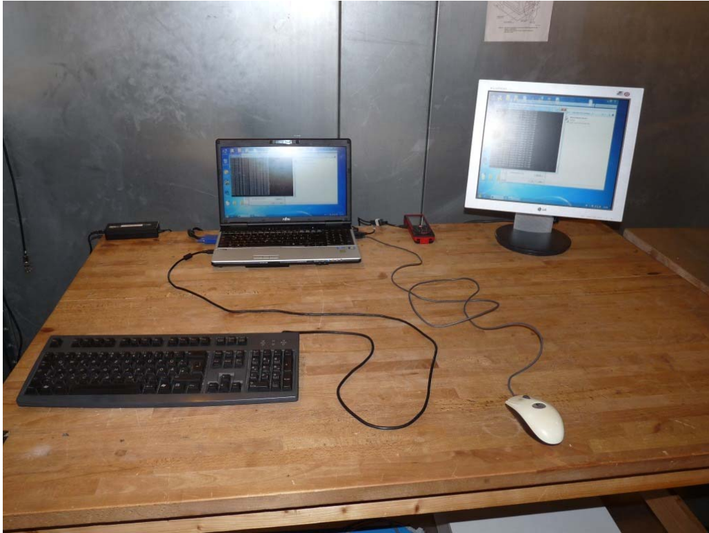
Photo 1: Test setup for conducted measurements (computer peripheral setup, EUT supplied by USB-cable from computer, unintentional radiator §15)