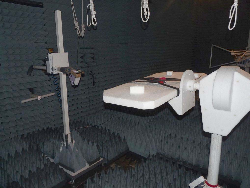
Photo 4: Test setup for radiated measurements (Enclosure, fully-anechoic chamber, 18-25 GHz, intentional radiator § 15)