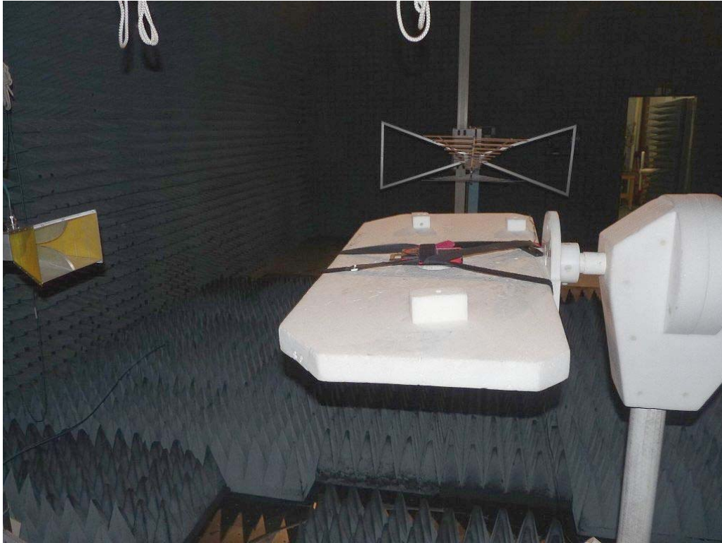
Photo 3: Test setup for radiated measurements (Enclosure, fully-anechoic chamber, 1-18 GHz intentional radiator §15 / 30 MHz – 10/20 GHz §22/24/27)