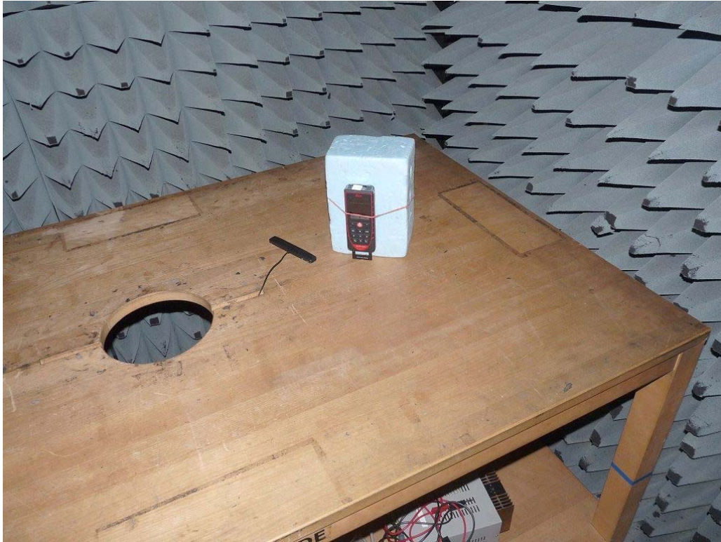
Photo 1: Test setup for radiated measurements (Enclosure, below 30 MHz, intentional radiator §15)