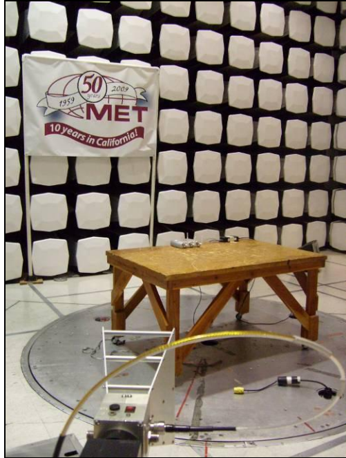
Photograph 5. Radiated Emission, Test Setup, 1 GHz – 6 GHz