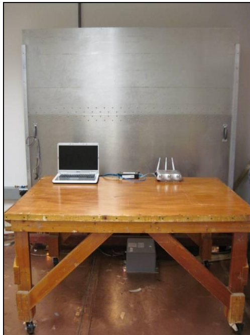
Photograph 6. Conducted Emissions, 15.207, Test Setup