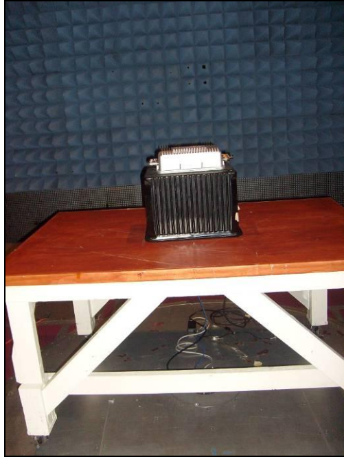
Photograph 1. Radiated Emission Spurious Test Setup