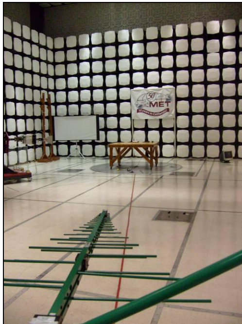
Photograph 4. Radiated Emission, Test Setup, 30 MHz – 1 GHz